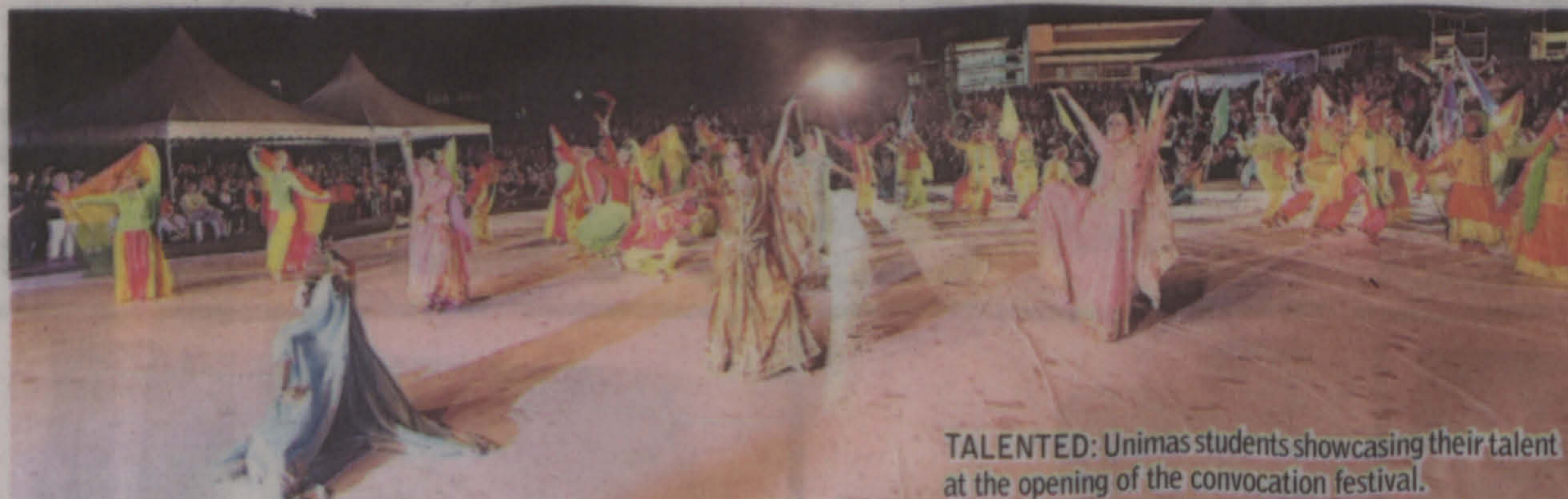
TALENTED: Unimas students showcasing their talent at the opening of the convocation festival.