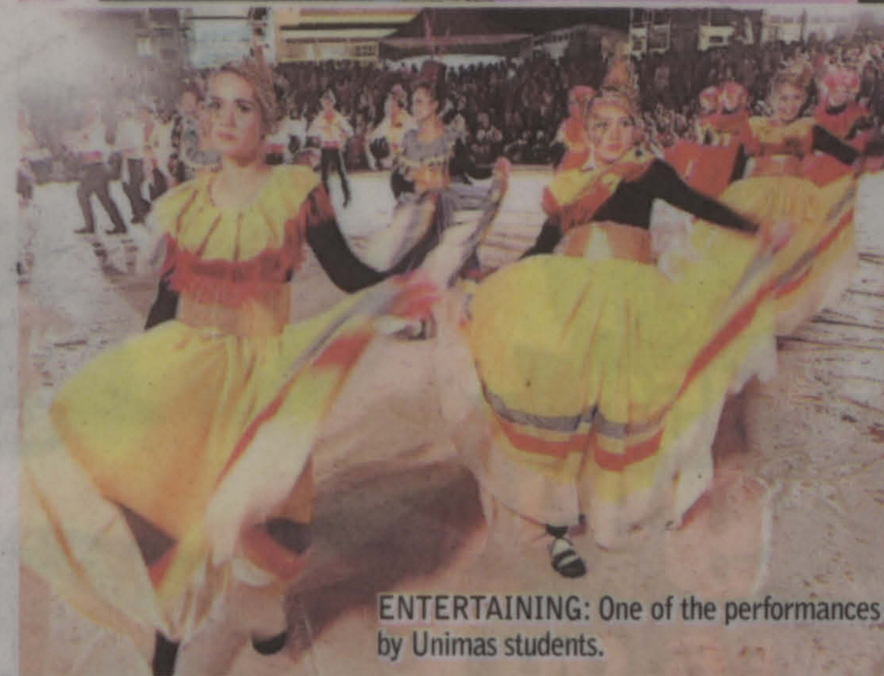
ENTERTAINING: One of the performances by Unimas students.