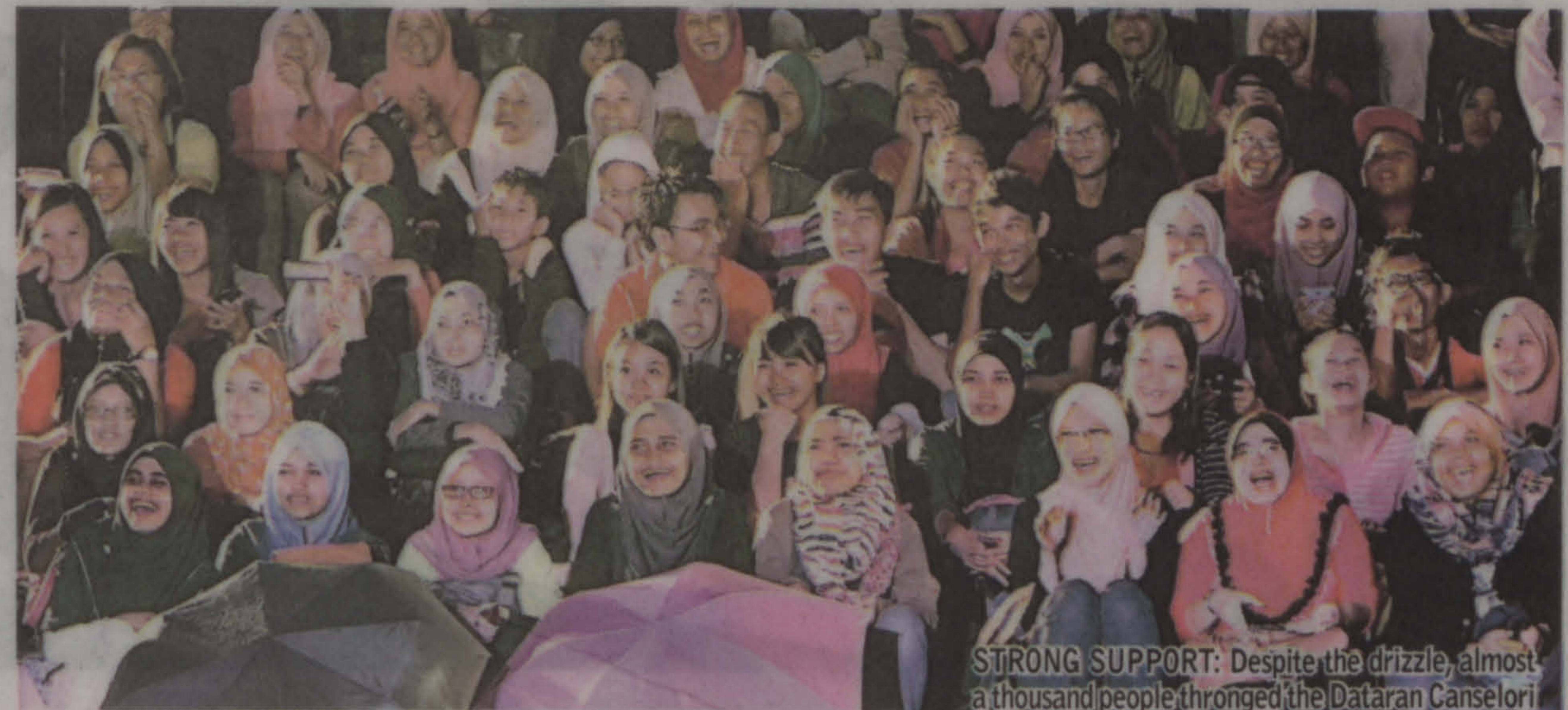
STRONG SUPPORT: Despite the drizzle, almost a thousand people thronged the Dataran Canselori on Wednesday night to witness the opening ceremony.

Themed 'Smart Partnership Programmes 2012', the festival consists of 13 programmes, ranging from singing competition, cooking contest, sports activities such as bowling, futsal, rugby and tennis as well as exhibitions.