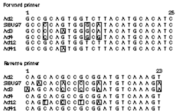
Figure 1: Alignment of forward and reverse primer priming sites. Mismatches to Allard primer sequences 4 are boxed. Genbank accession numbers: Ad2, J01917; Ad3, X76549; Ad4, AF065064; Ad12, X73487; Ad41, D13781.

Cytopathic effect was seen in long-passage material from A549 cells inoculated with samples in 15 patients: ten (63%) of 16 children who died and five (63%) of eight surviving children with AFP. The identification of this agent was difficult because it was hard to grow in sufficient