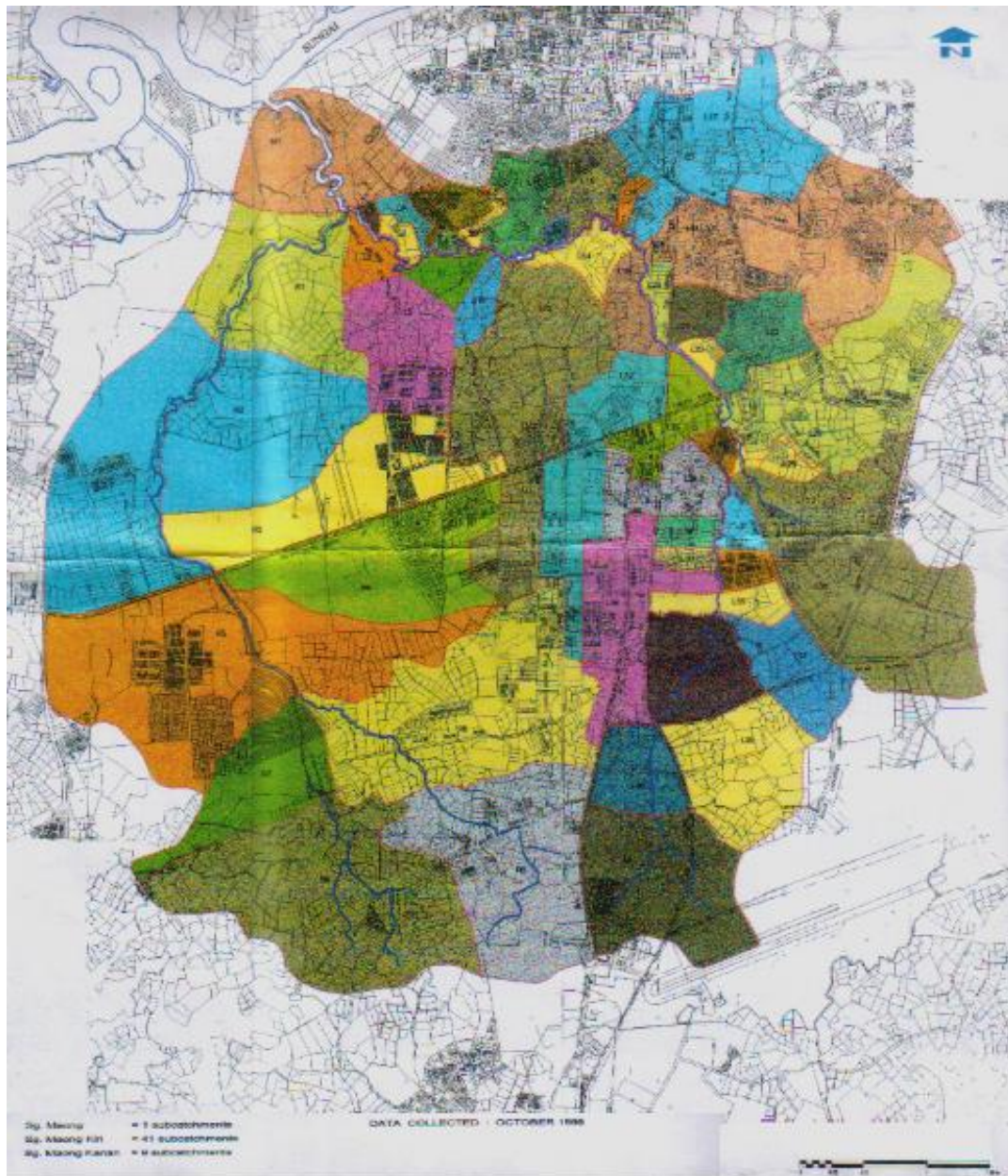
Figure 1.2 Maong River Catchment – Subcatchment