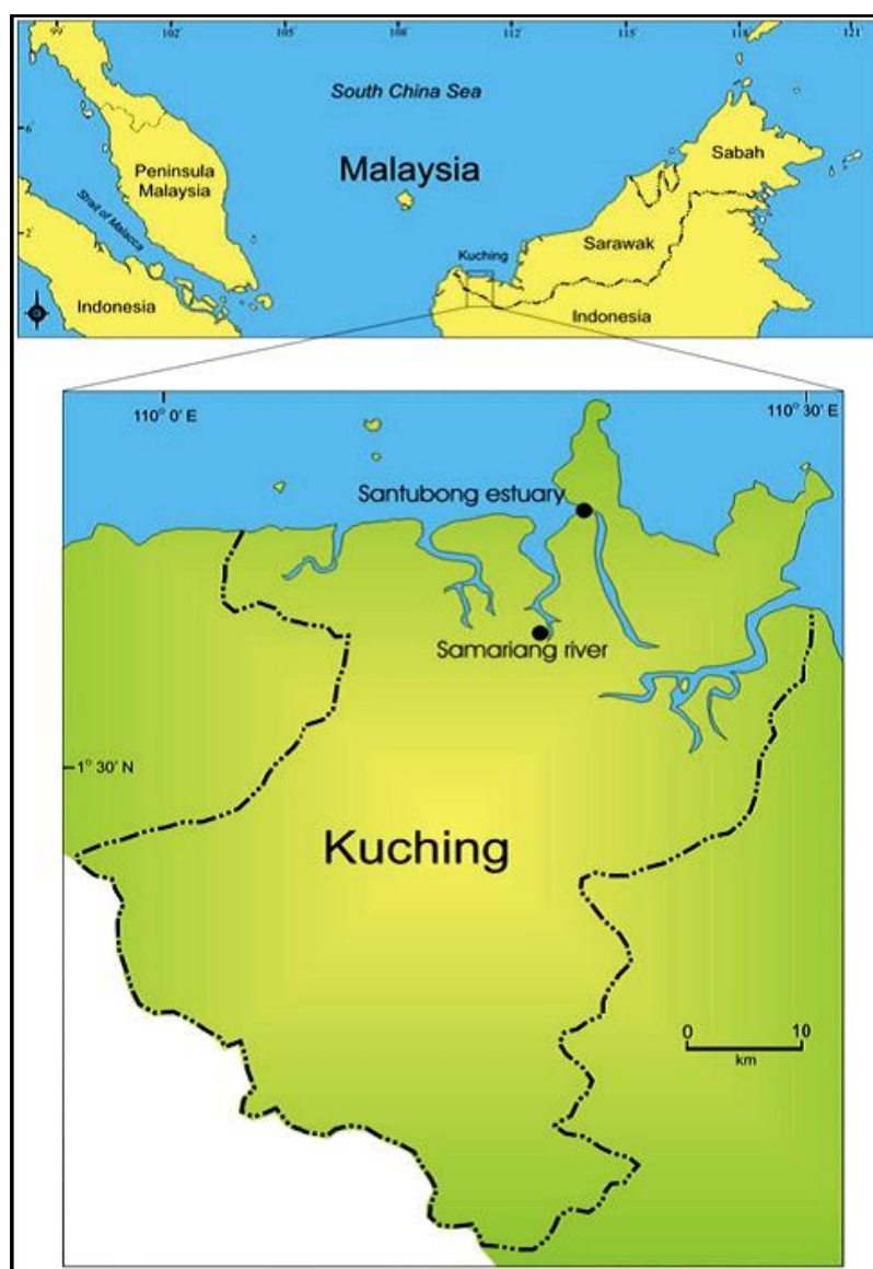
Figure 3.1: Map showing sampling sites at Santubong and Samariang estuaries (black fill circles) (Hilaluddin et al., 2010).

Plankton samples were collected by using 20 \mu\text{m} mesh size plankton net. The plankton samples were collected fortnightly from August to December 2010 during high tide in Santubong and Samariang estuaries (Figure 3.1). The live plankton samples were used for cell isolation to establish clonal cultures.