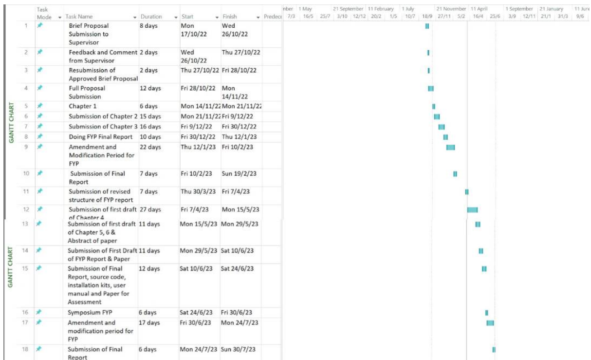
Figure 1.1 Gantt Chart