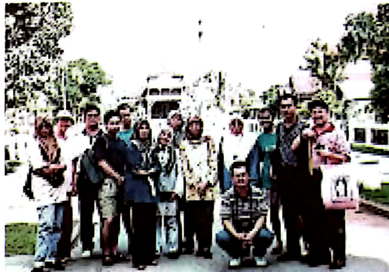
In front of (Istana) Keraton Kadariah Pontianak, a distant remnant of the Pontianak Sultanate after the last sultan was deposed by the people in 1950 following the formation of Indonesia as a republic.