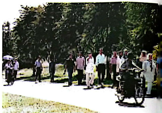
UNIMAS entourage making our way into the UNTAN campus, trying to be as inconspicuous as possible. At least, so we thought.

As values and goals change with time and technology, like a big town anywhere, people tend to mind their own business more and care about others less. "Intelligence is the ability to adapt to change", so said Stephen Hawking. Although I do not necessarily agree, I must concede, adapt we must.