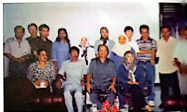
With the Dean and dozens during our courtesy visit to FISIP.