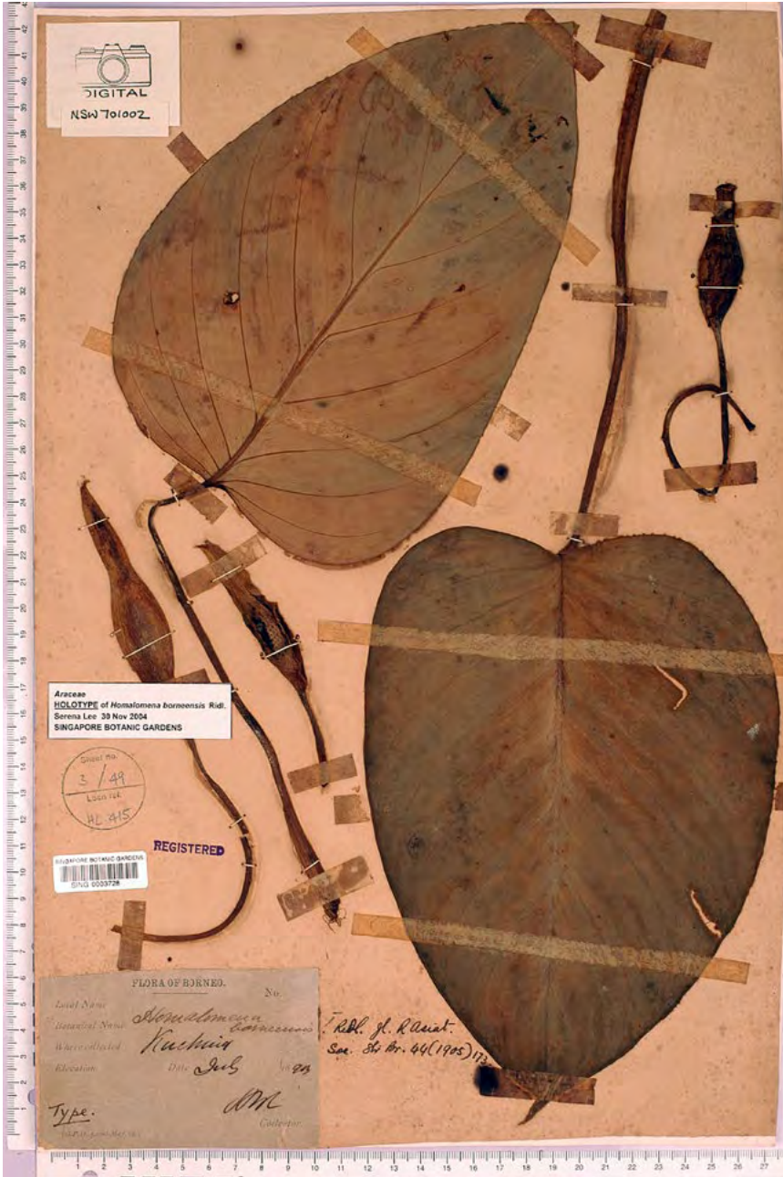
Figure 4. Holotype of Homalomena borneensis . H.N.Ridley s.n. in the Singapore Herbarium Holotype SING.