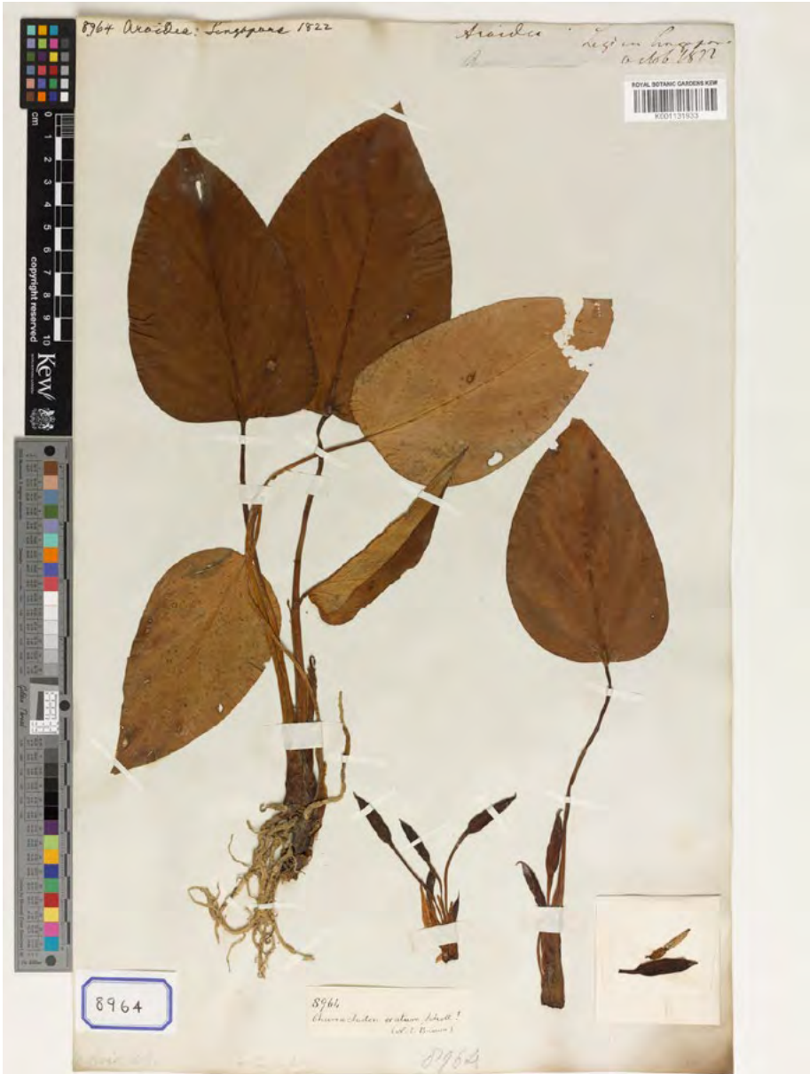
Figure 6. Isotype of Homalomena nathanielii. N.Wallich Cat. no 8964, in the East India Company Herbarium at Kew (K-W), ( http://specimens.kew.org/herbarium/K001131933).