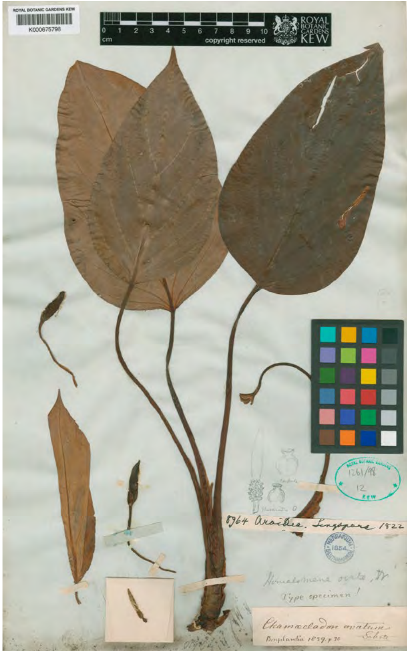
Figure 5. Holotype of Homalomena nathanielii. N.Wallich 8964, in the Kew Herbarium (K), ( http://specimens.kew.org/herbarium/K000675798).