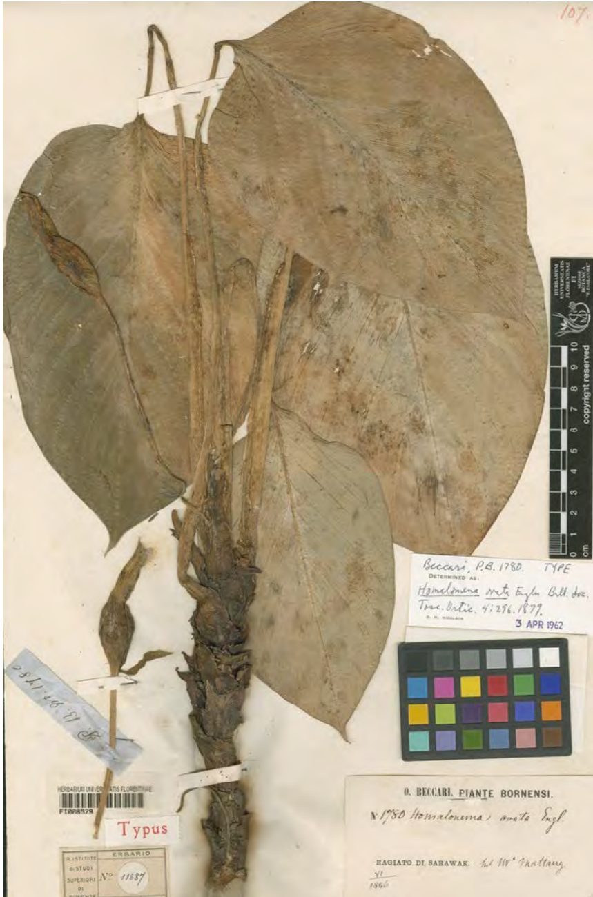
Figure 1. Holotype of Homalomena ovata . O. Beccari p.b. 1780 in the Herbarium Beccarianum-Malesia (FI-B), of the Natural History Museum of the University of Florence