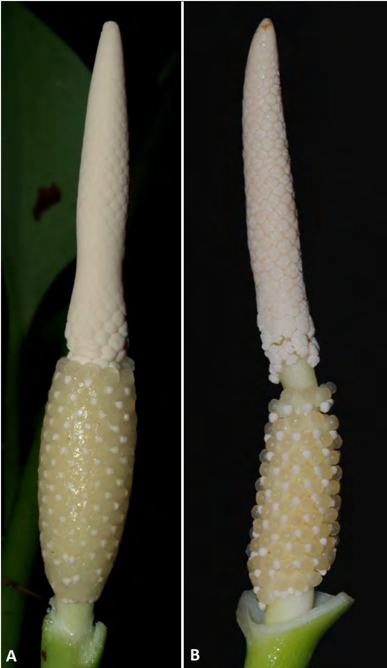
Figure 3. Spadix of (A) Homalomena ovata & (B) Homalomena borneensis compared, each 9.5 cm long.