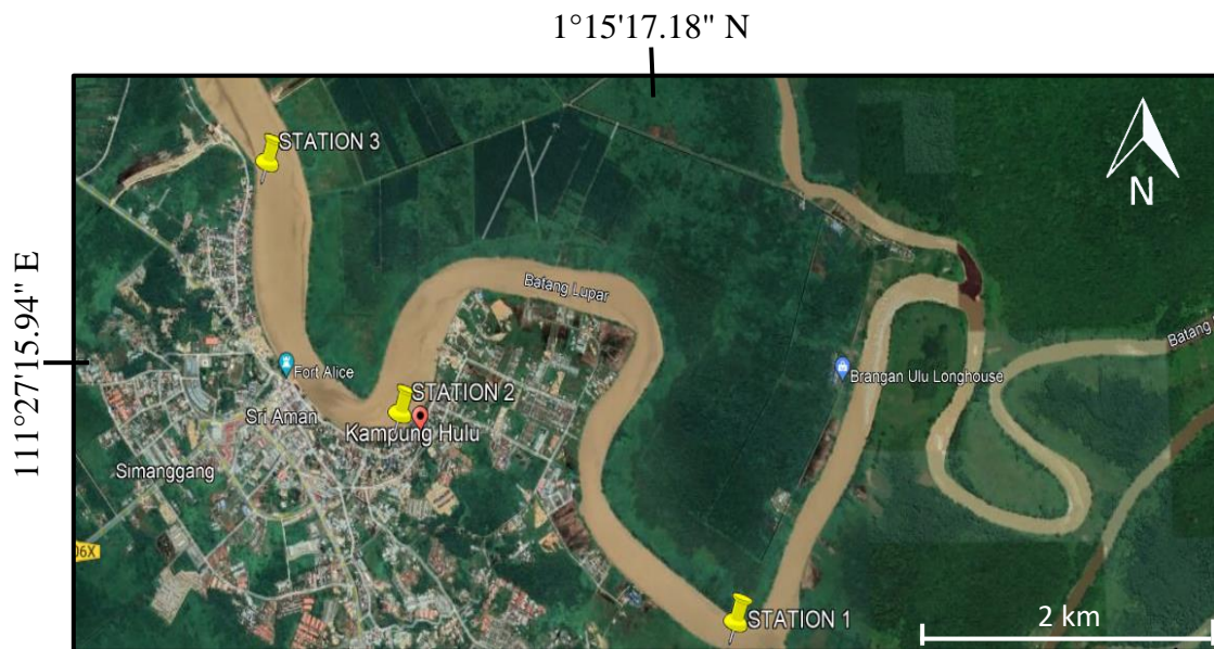
Figure 2 A map showing three sampling stations for sample collection in the Lupar River.

The study location was at the Lupar River in Sri Aman, Sarawak. The sampling was carried out in three stations. A total of 41 samples of M. rosenbergii were collected during this study. Figure 2 and Table 2 illustrate the coordinates of each sampling stations and the map of the sampling location. The sample collections were done from 6 th December 2021 to 30 th January 2022.