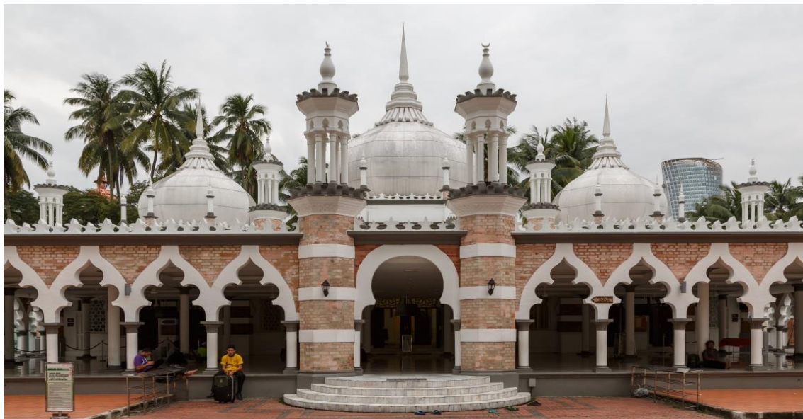
Figure 2.2: Jamek Mosque, Kuala Lumpur (1909)