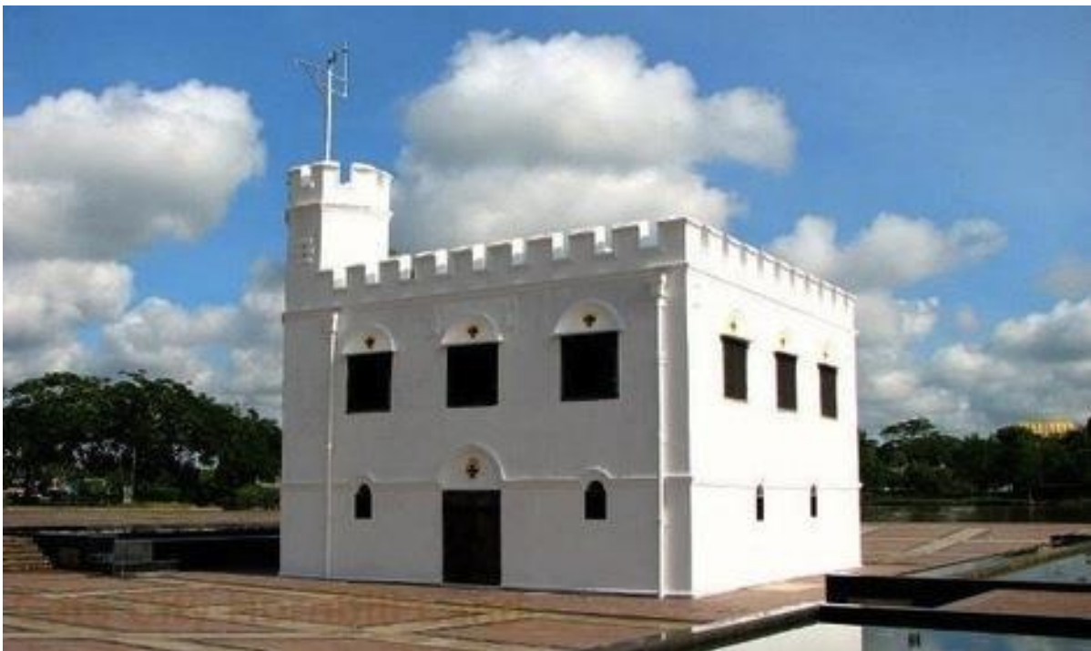
Figure 2.4: The URM building of Square Tower, Kuching