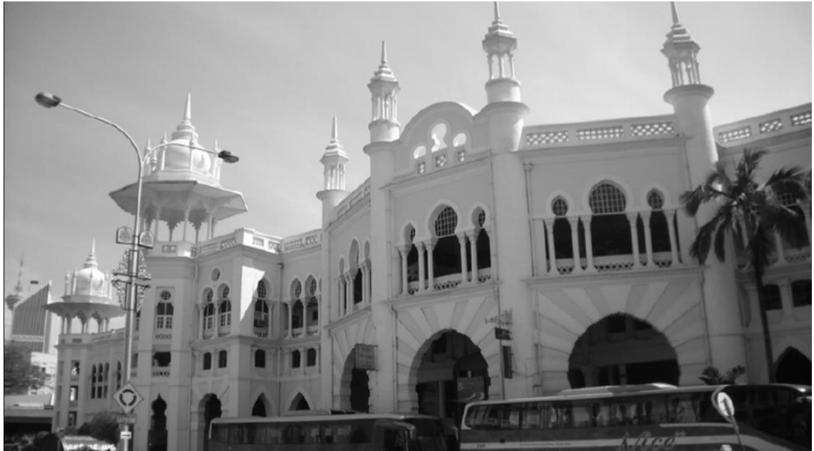
Figure 2.1: Kuala Lumpur Railway Station in the center of Kuala Lumpur (Al-Syam & Badarulzaman., 2010)