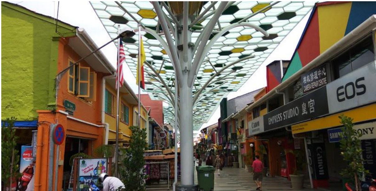
Figure 2.3: India Street in Kuching Sarawak