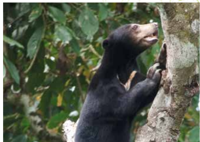
One of the ex-captive Sun Bear from Bornean Sun Bear Conservation Centre which was previously kept as pet