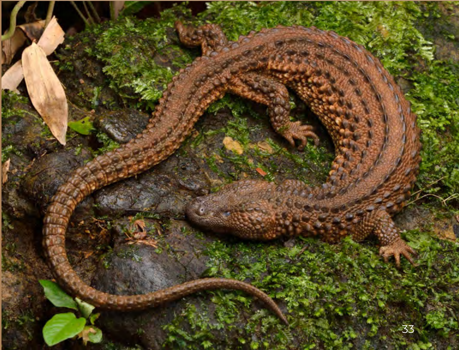
Fig. 6. A distinctive member of Borneo's herpetofauna is the Bornean earless monitor ( Lanthanotus borneensis ), described as the 'holy grail of herpetology', the species, genus and family (Lanthanotidae) being endemic to the island. This image forms the basis of the logo of the upcoming Congress.