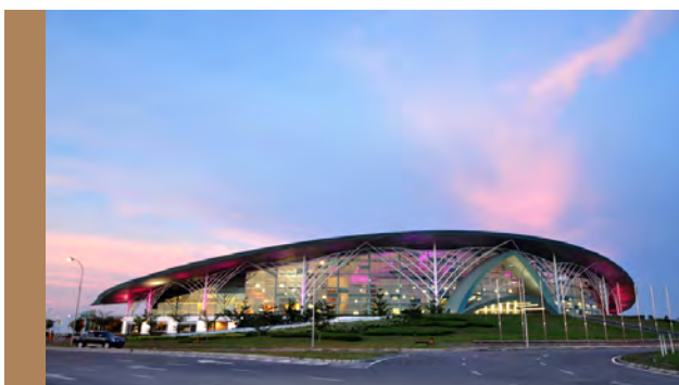
Fig. 3. The Borneo Convention Centre Kuching, venue of the 10 th World Congress of Herpetology.

BCKK is an initiative of the Sarawak Government to host mega business gatherings, and has hosted, to date, about 1,400 events, totalling 1.7 million delegates and visitors from around the world.