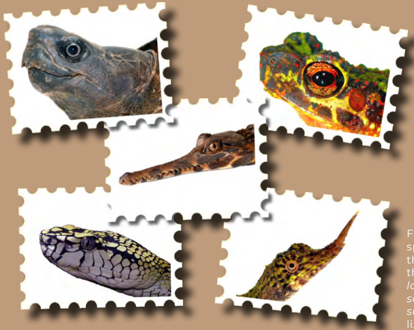
Fig. 5. Here are some of the exciting species you can encounter in Sarawak: the spiny hill turtle ( Heosemys spinosa ), the Bornean rainbow toad ( Ansonia latidisca ), false gharial ( Tomistoma schlegelii ), Sumatran pit viper ( Parias sumatranus ), and the Bornean horned lizard ( Harpesaurus borneensis ).