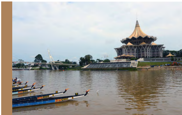
Fig. 2. A view of Kuching, from the south bank of the city, showing Sarawak River and the State Legislative Building.

The venue is located on the Kuching Isthmus and ringed by the Sarawak River. At about 15 minutes' drive from the City Centre and 20 minutes from the International Airport, its location can be called strategic.