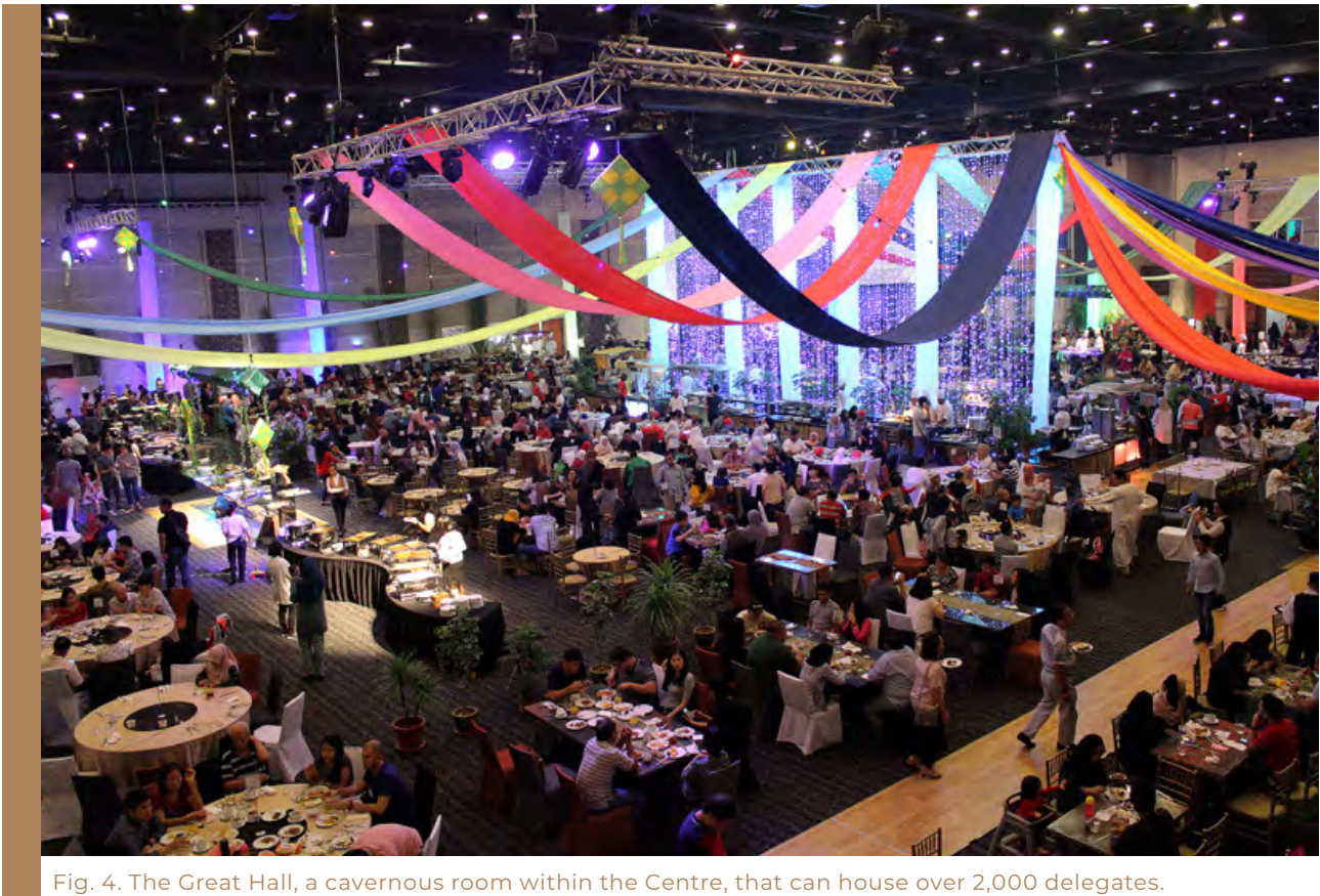
Fig. 4. The Great Hall, a cavernous room within the Centre, that can house over 2,000 delegates.

The more intrepid traveller may opt for the interiors of the island, accessible only via long-boat, followed by homestays with indigenous people and forays into rainforests. Or consider a visit to the State's UNESCO Site, Gunung Mulu National Park, a short direct flight out of Kuching, and home to some 200 species of amphibians and reptiles.