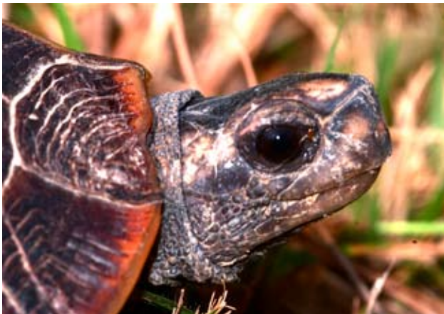
Figure 3. Melanochelys tricarinata , Dehradun, Uttaranchal, India. Adult female.

The plastron is long, usually as long as the carapace, and notched posteriorly. The hind plastral lobe is narrower than the shell opening, and longer than the width of the bridge. The longest median suture is between the pectorals or the abdominals, and the shortest between the humerals or the femorals. Axillary scutes are usually present, whereas inguinals are usually missing. Females have a fibrous connection between the hypoplastra and the carapace. The anterior digits are half webbed, the posterior digits virtually unwebbed. The outer surfaces of the forelimbs have enlarged, squarish, somewhat pointed scales. The snout is short, and the upper jaw feebly notched. The carapace is dark olive, gray-black,