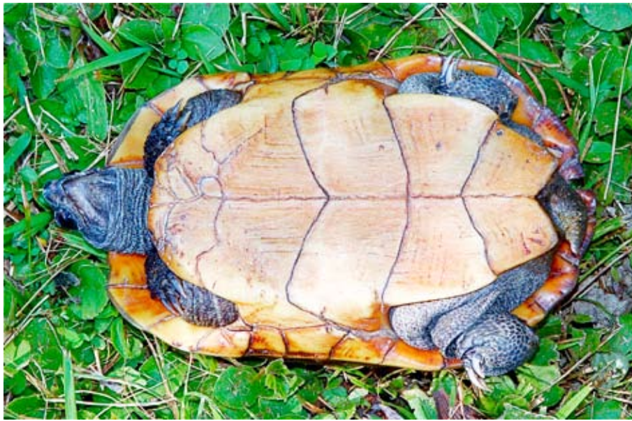
Figure 2. Melanochelys tricarinata , Dehradun, Uttaranchal, India. Adult female.

lacking serrations or scalloping. The nuchal scute is small and arrow-shaped in dorsal aspect. Vertebral scutes I–IV are all relatively broad towards the front, and are all narrower than the costal scutes. The areolae of all the carapace scutes remain contiguous with the posterior margin of the scute throughout life, except for vertebral 5 in which the areola remains approximately centrally located on the scute.