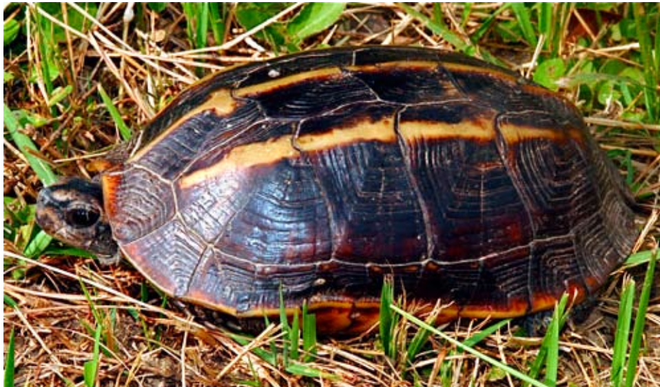
Figure 1. Melanochelys tricarinata , Dehradun, Uttaranchal, India. Adult female.

Description. – The carapace is elongated, strongly arched, with relatively flat, sloping sides. The carapace is tricarinate, the vertebral keel being by far the most prominent, with the lateral keels serving to demarcate the ridge at which the nearly horizontal vertebral area joins with the much more nearly vertical flanks. The rim of the carapace is smooth,