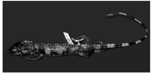
Figure 1. The second known specimen (SP 06712) of Complicitus nigrigularis (Ota & Hikida, 1991).

Manthey and Grossmann (1997) diagnosed the monotypic genus Complicitus (Latin for black-throated, an allusion to the throat colouration of the holotype), with Calotes nigrigularis Ota and Hikida, 1991, as the type species, based on this material. The genus and species were characterised by the following combination of characters: arboreal agamid; dewlap with lateral pockets and granular scutellation; nuchal crest present; limbs and tail relatively short; dorsal scales heterogenous and rhombic, their tips typically rounded and dorsals and ventrals subequal. Apart from listing in taxonomic works (e.g., Welch, 1994; Manthey and Grossmann, 1997; Manthey and Denzer, 2000; Malkmus et al., 2002; Das, 2004; 2006; Das and Yaakob, 2007),