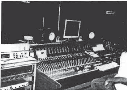
A music production studio which uses the analogue and digital (MIDI) recording systems