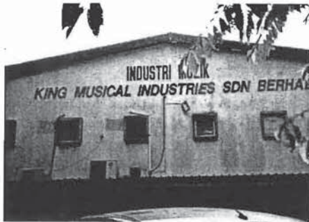
The history of development in the music industry is said to begin in King Studio