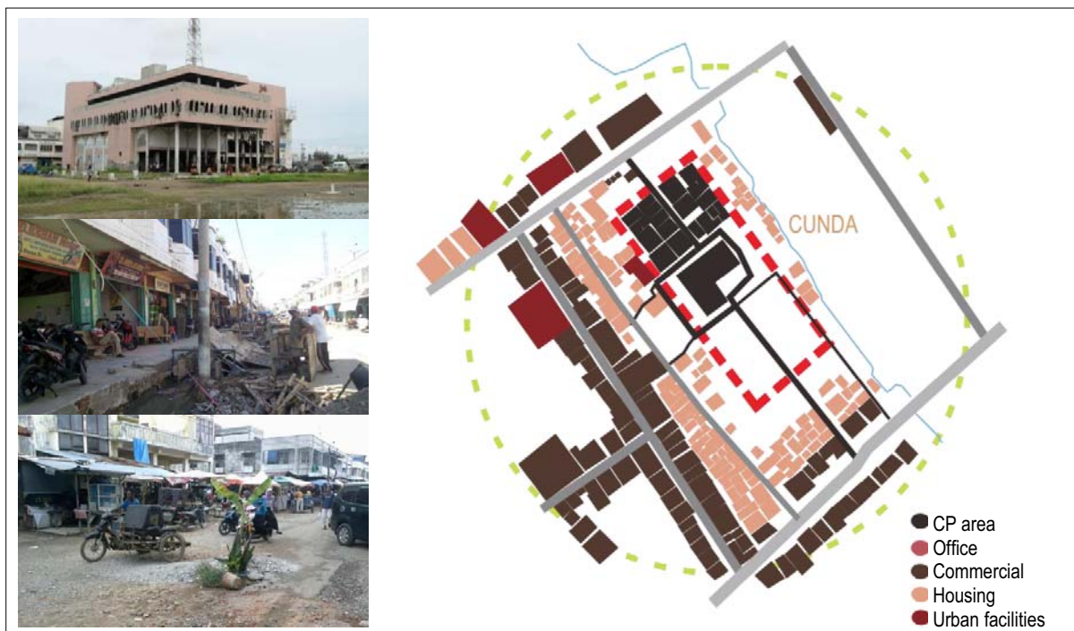
Figure 1. Land use and buildings

The diagram shows the location of Cunda Plaza and its urban context.