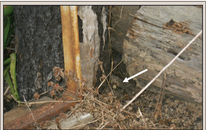
FIG. 1. Oxyuranus scutellatus (Taipan) settled in a burrow following the homing event.

We arrived at Wetherby Station about 1800 h and were directed to viewing stands on a concrete platform erected for cattle auction attendees. Our horse-mounted host allowed about 12 cattle to enter the viewing pen. When his previously-calm horse became agitated, our host looked into the area between viewing paddock and tree line, approximately 12 m distant, and exclaimed “Taipan.” The snake was moving slowly but steadily—seemingly purposeful, head raised only slightly in the direction of the platform. Upon reaching the platform it turned without hesitation and crawled along the ground against the concrete edge of the platform in my direction. Stopping about 0.2 m from my foot, it reoriented and, seamlessly, crawled onto the concrete platform, passed beneath the viewing stand, and entered what was likely a rodent burrow located along the foundation for a barn just behind the viewing stand. Once in the burrow, the ~1.5-m Taipan re-emerged slightly, re-positioned and withdrew, leaving its head facing out from the burrow’s entrance (Fig. 1). As this individual passed rapidly, but unhurriedly, through a small herd of cattle to take shelter in a burrow without apparent searching, this observation suggests it was returning to a previous refuge site, thereby demonstrating homing ability.