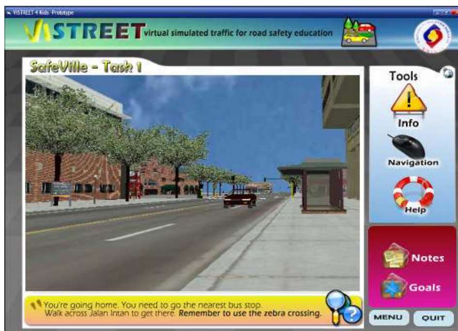
Figure 2: A sample screenshot of the VR-based learning environment in ViSTREET prototype

Again, feedback from all the experts was gathered and necessary revisions were made. This single-path prototype was then used to develop the remaining four scenarios. Upon completing the full prototype, verification from the content expert was obtained and followed by one-to-one evaluation consisting four potential learners in the pilot study. Based on the gathered feedback, necessary revisions were made to produce the final version. A sample screenshot of the VR-based learning environment in ViSTREET prototype is shown in Figure 2.