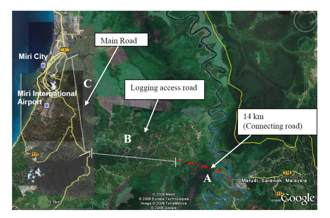
Figure 1: The road from Marudi Town to Miri City

In 2002, the Sarawak state government received funding from the federal government for rural development projects in Sarawak. With the available funding, a 14 km unpaved rural connecting road (Part A in Figure 1), which cost RM 1 million was constructed from Marudi Town to connect with the logging access road (Part B in Figure 1) between 2002 and 2005.