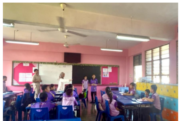
Elements of fun were incorporated to create an enjoyable learning experience.