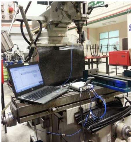
Fig.1: Experiment set-up

Impact hammer excitation is the common method of measuring frequency response function. Figure 1 shows impact hammer excitation test set. An impact hammer was used to generate the excitation to measure cutting tool FRF. Then, the signal processing responses captured by a tri-axial accelerometer attached to the cutting tool. The tri-axial accelerometer was used to measure FRF response signal in each DOF (Degree of Freedom) that includes all 3 axis; X, Y, and Z axis. Lastly, the measured data were recorded and collected using the Multi-Channel Data Acquisition System and analyse using a PC-based data acquisition Analyzer. The DAS is to convert the analog time domain signal into digital frequency domain information compatible with digital computing and then to perform the required computations with these signals. A visual experimental finite element analysis was done to predict how the cutting tool is vibrating yet where excessive vibration levels occur for various points and direction. Lastly, a finite element modelling was done to validate the experimental modal analysis result collected earlier. Figure 2 shows the position of accelerometer and different knocking point. The accelerometer moved 32 points around the cutting tool. Impact hammer was applied vertically at the knocking point. The testing is made within 4 points selected at every angle of 90^\circ . The total of points at every angle is 8 points on the cutting tool.