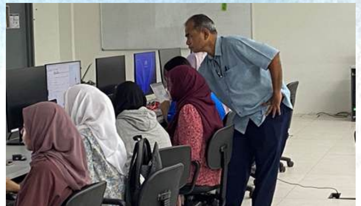
Critique session and 1-on-1 with course lecturers. Providing valuable feedback for better improvement and growth