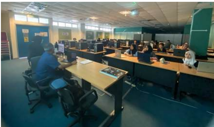
First class of Digital Art. Introducing The Course and What We'll Be Learning Together!