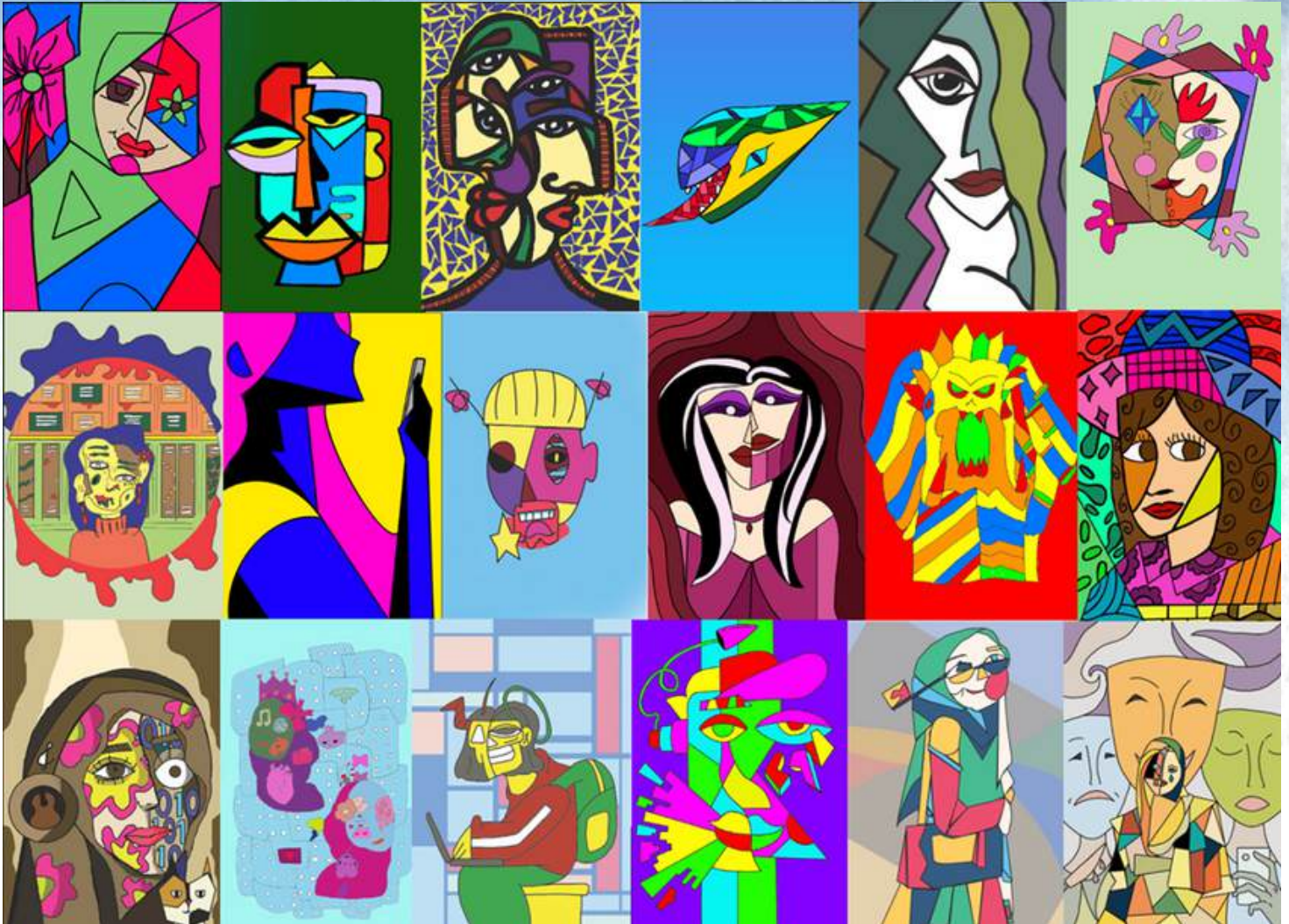
Eye-catching Digital Paintings Created by Our Students.