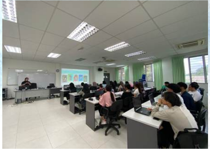
Project 1 Digital Painting progress shared on Padlet via eLeap. Great work so far!

The workshop, organized by the Faculty Quality Management Committee (FQMC), aimed to strengthen understanding of Continuous Quality Improvement (CQI) practices and foster a culture of accountability in academic processes. Critical discussions focused on integrating audit feedback into CQI processes to ensure improvements are made based on targeted interventions. Participants gained valuable insights into closing the quality loop, with practical strategies provided for enhancing the quality of academic programs.