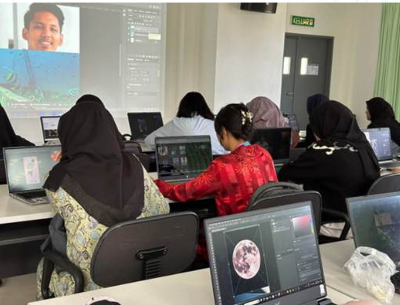
Students exploring Adobe Photoshop to unlock their creativity through image manipulation techniques.