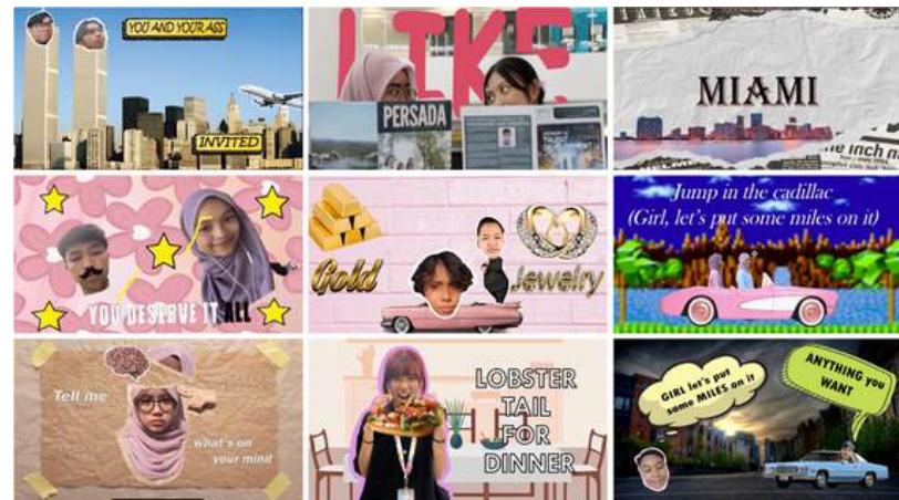
A glimpse of the motion art video clips created by our students for the music video project.