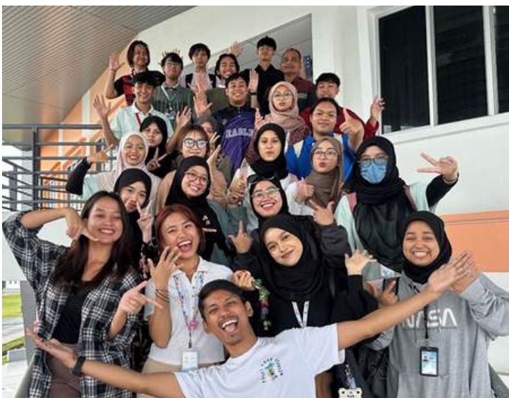
A memorable group photo to end PRL1053 Digital Art course for this semester.