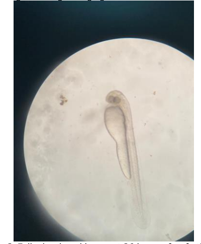
Figure 6. Fully developed larvae at 26 hours after fertilization.