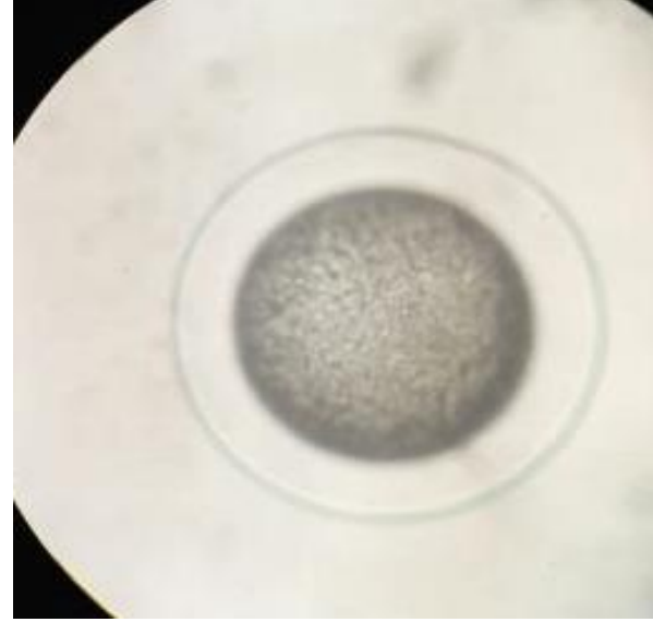
Figure 3. Fertilized egg 2 minutes after spawning.