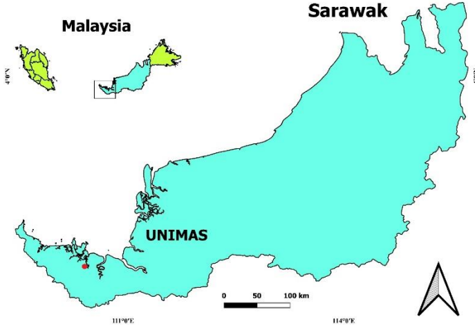
Figure 1. The study was conducted in the laboratory of UNIMAS, Malaysia. 2.3 Broodstock selection

A total number of 12 pairs (24 fish) of mature P. sealei were obtained from the Aquatics Wet Lab, Faculty of Resources Science and Technology UNIMAS Campus, Malaysia (Figure 1).