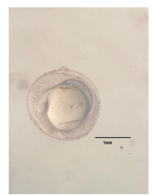
Figure 4. Organogenesis of developing embryo at 7 hours after fertilization.