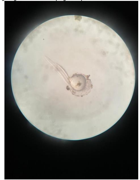
Figure 5. Prime stage showing emerging fish larvae at 20 hours after fertilization.