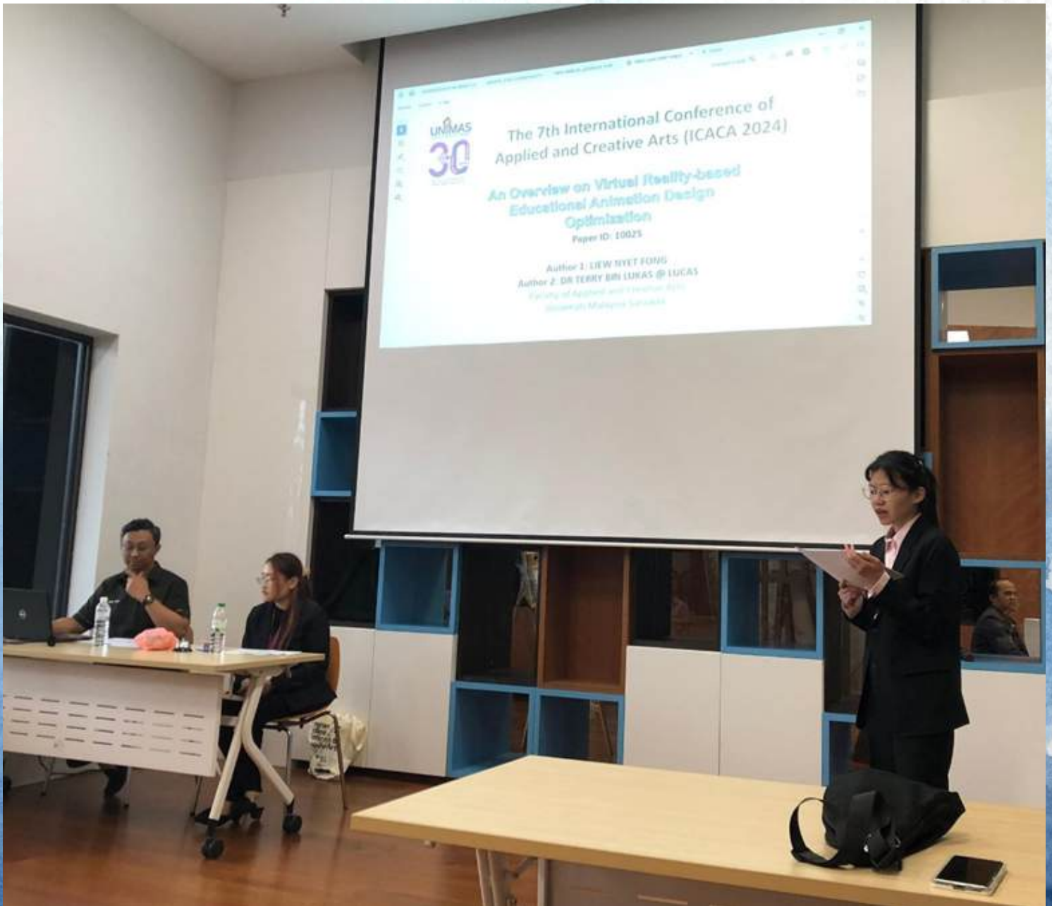
My Presentation Session