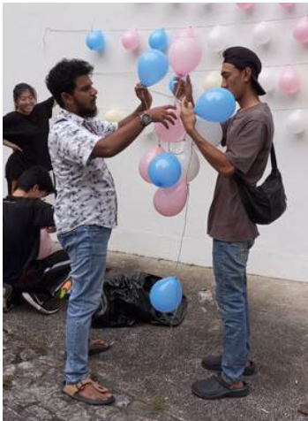
Year 2 Animation Students Doing Preparations before The Ceremony

The program featured a variety of engaging activities designed to encourage interaction and reflection. Highlights included interactive mini-games such as Balloon Pop, Mystery Gift, Balloon Sit and Pop, and Arm Wrestling, as well as sharing sessions where senior students exchanged insights and experiences with their juniors.