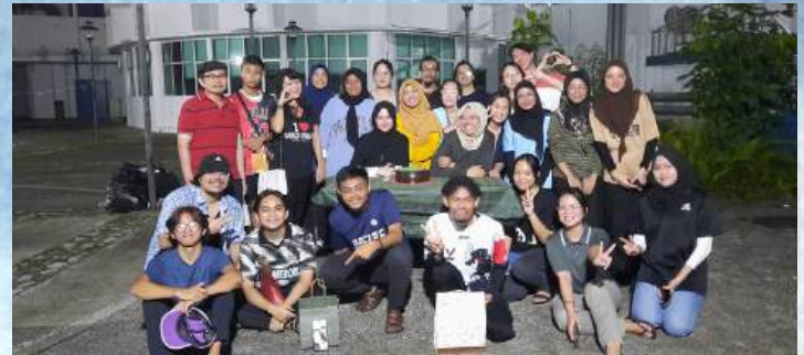
Group Photo of Animation Seniors and Lecturers

On July 13, 2024, a memorable farewell ceremony was held at Ruang Legar, Level LG, FSGK, organized by the Year 2 Animation students to honor the Year 3 cohort of the Animation program. This event was not merely a farewell but a celebration of the accomplishments of the graduating Year 3 students, as well as an opportunity to strengthen interpersonal relationships among Animation students across all cohorts. The ceremony was attended by approximately 55 participants, including students and lecturers. Its primary objective was to recognize the contributions and achievements of the Year 3 students while fostering a sense of community among Year 1, Year 2, and Year 3 cohorts.