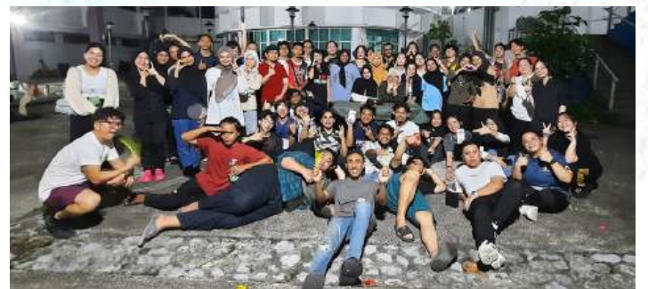
Group Photos with All Animation Programme Family Members

The event concluded with a BBQ dinner, where attendees enjoyed delicious grilled food and participated in lively conversations. These activities not only provided entertainment but also created cherished memories for the Year 3 students as they prepared for their upcoming Industrial Training semester. In conclusion, the event successfully captured the spirit of camaraderie and unity among the students. Special recognition is extended to the Year 2 Animation students, whose dedication and meticulous planning were instrumental in organizing this meaningful and unforgettable occasion, enriching the experiences of their peers.