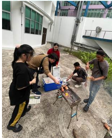
Year 2 Animation Students Preparing the BBQ Pit