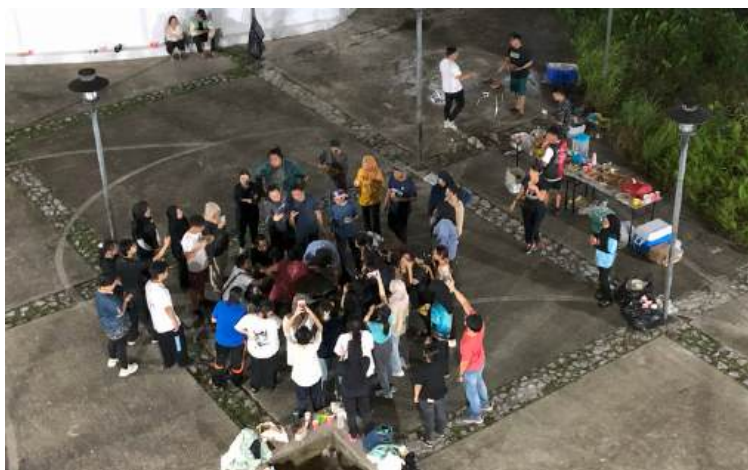
Animation Students Participating in a Mini Game Activity

The event concluded with a BBQ dinner, where attendees enjoyed delicious grilled food and participated in lively conversations. These activities not only provided entertainment but also created cherished memories for the Year 3 students as they prepared for their upcoming Industrial Training semester. In conclusion, the event successfully captured the spirit of camaraderie and unity among the students. Special recognition is extended to the Year 2 Animation students, whose dedication and meticulous planning were instrumental in organizing this meaningful and unforgettable occasion, enriching the experiences of their peers.