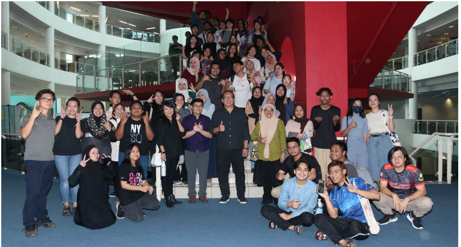
Group Photo with All Animation Students and Lecturers