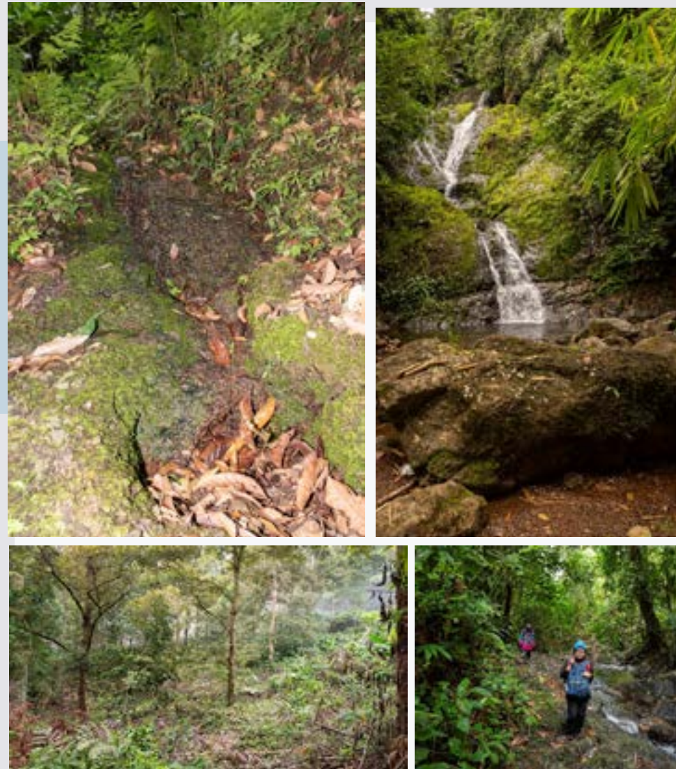
Figure 3. Habitats of Padawan's crab in Kpg Sentah (top-bottom left) and Kpg Bidak (top-bottom right) in Padawan. The habitats of the Padawan crabs are currently protected under the communal forest law that is managed by the local community. Bottom left is a durian garden in Sentah; Bottom right is a recreational site of Sebarau Waterfall.