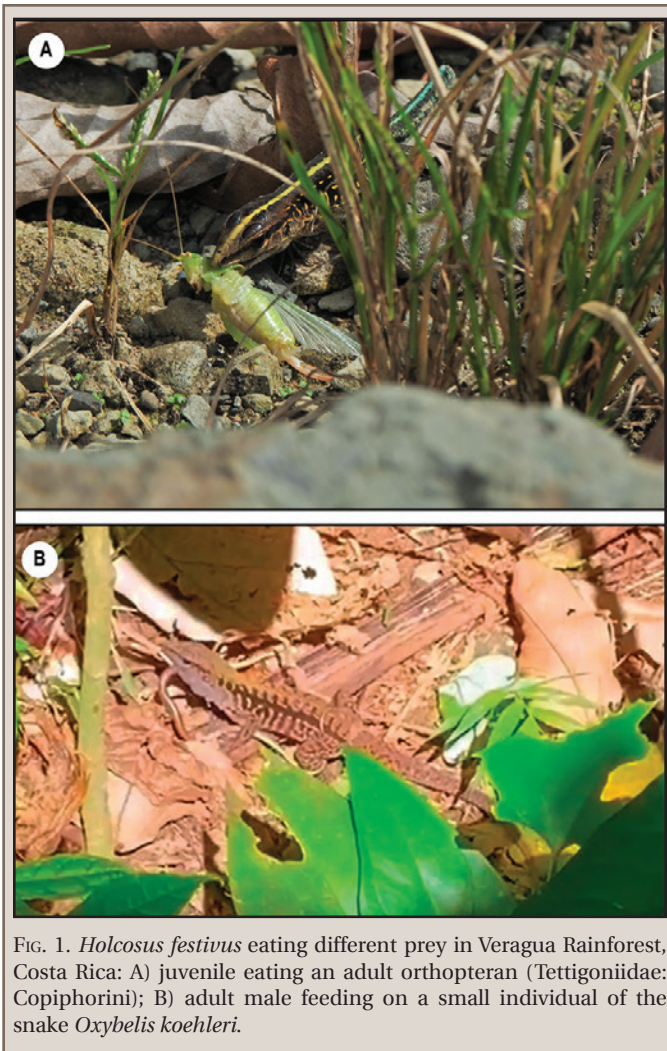
FIG. 1. Holcosus festivos eating different prey in Veragua Rainforest, Costa Rica: A) juvenile eating an adult orthopteran (Tettigoniidae: Copiphorini); B) adult male feeding on a small individual of the snake Oxybelis koehleri .

understory environments. Here we present two instances of H. festivos concerning its diet and feeding behaviors at Veragua Rainforest Preserve, Las Brisas de Veragua, Limón, Costa Rica (9.9264°N, 83.1876°W; WGS 84; 420 m elev.).