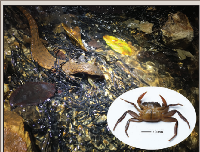
FIG. 1. Borneosa kapit caught by female Lanthanotus borneensis (145 mm SVL, 30 g). Inset: Crab, B. kapit , captured by female Lanthanotus borneensis on 15 September 2020. Scale bar = 10 mm.

2020, at 2240 h, one of our adult female L. borneensis (140 mm SVL, 34 g) was observed with a crab, Borneosa kapit , in its mouth (Fig. 1) along a rocky stream after a rain shower. It appeared the lizard had just acquired the crab and held it for about five minutes, during which time both the crab and the lizard were motionless. We then captured the lizard and placed it in a bag