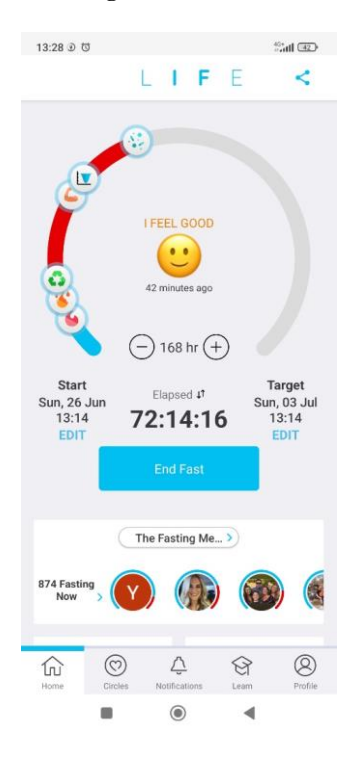
Figure 2.2: Life fasting app

LIFE is an intermittent fasting app developed by LifeOmic (LifeOmic, 2018). It has a special feature that allows users to join or create a circle to interact and motivate each other. According to Oussedik et al. (2017), accountability and peer support play important roles in sustaining lasting changes in your lifestyle.