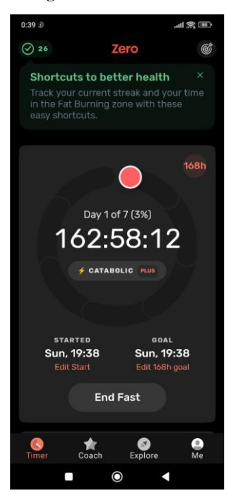
Figure 2.3: Zero fasting app

Zero is an intermittent fasting app developed by Zero Longevity Science, Inc (Longevity Science,Inc, 2019). Like other similar fasting apps in the market, it is designed to track your progress and make notes on the fasting and weight management journey. The key features that the app include: