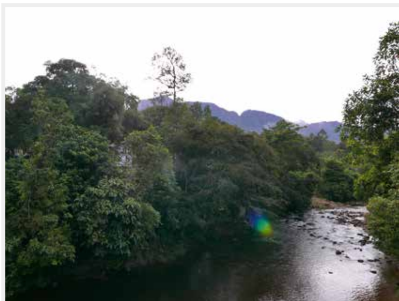
Figure 22.1. Sungai Pidiea facing upstream with background view of the Bungo Range.

The villagers believe that there is a potential for ecotourism in Tringgus that are biodiversity- and cultural heritage-based. Development of homestays and recreational areas have been progressing well by adopting beautiful sceneries of the rivers and mountains as well utilizing of forest materials such as bamboo, rattan and wood to preserve the authenticity of living in a traditional Bidayuh village. An information center has also been built for the management of tourism activities and to display the tourism products. At the time of this study, the entrance fee was not imposed yet, but the committee members have planned to start with the fees upon the completion of important management facilities and services with the guidance of Sarawak Tourism Board. The villagers hope that the implementation of the Tagang system would contribute to the conservation of aquatic life in Pediea River while sustaining ecotourism activities in Tringgus.