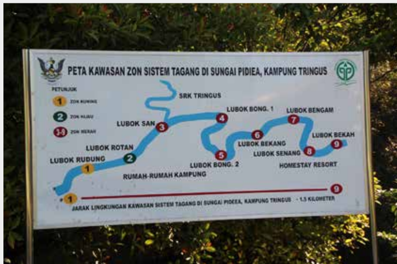
Figure 22.2. Three conservation zones of Tagang System designated along 1.5 km stretch of Sungai Pidiea.