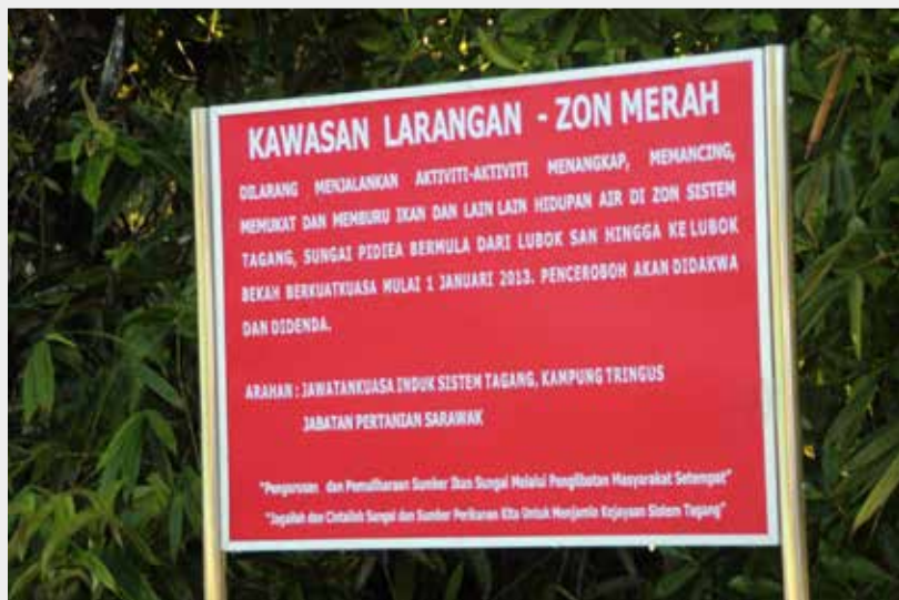
Figure 22.3. Signage denoting the start of the restricted Red Zone in Sungai Pidiea from Lubok San to Lubok Bekah.