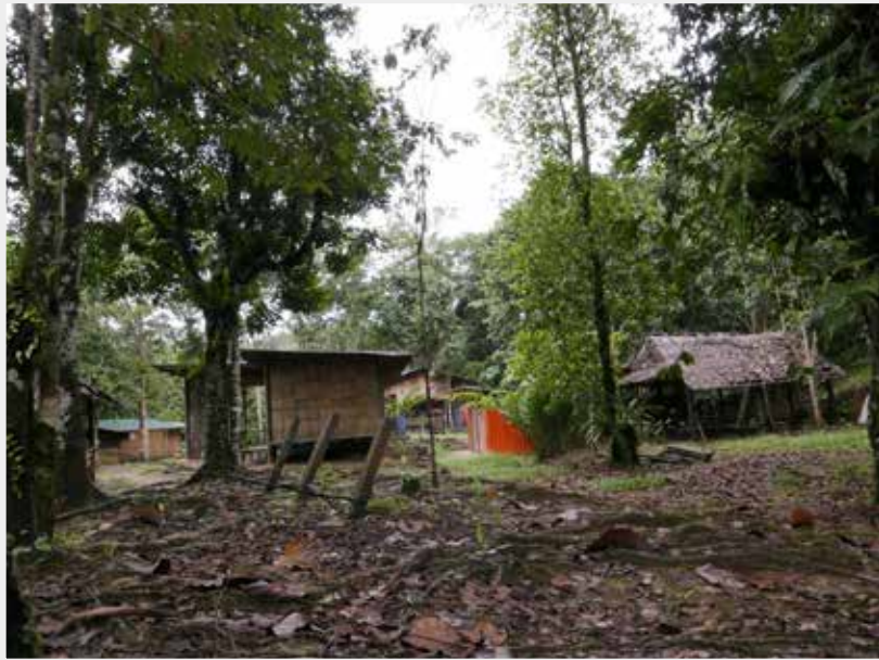
Figure 22.4. Homestays built by the river using forest materials.