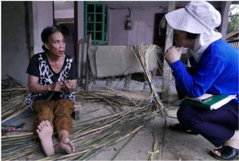
Figure 22.6. A villager uses her indigenous knowledge to prepare rattan materials for basket weaving.