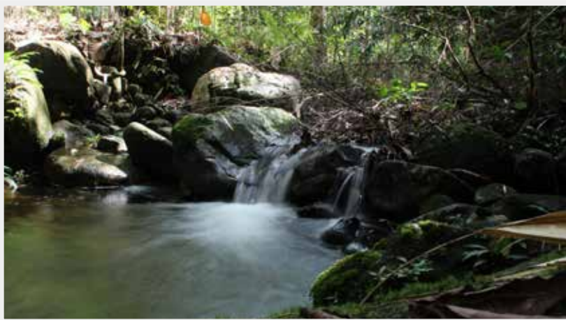
Figure 22.5. A waterfall in Tringgus as an attraction to visitors.