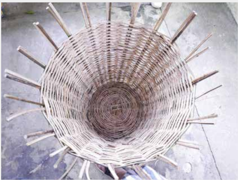
Figure 22.7. A work in progress of rattan basket.