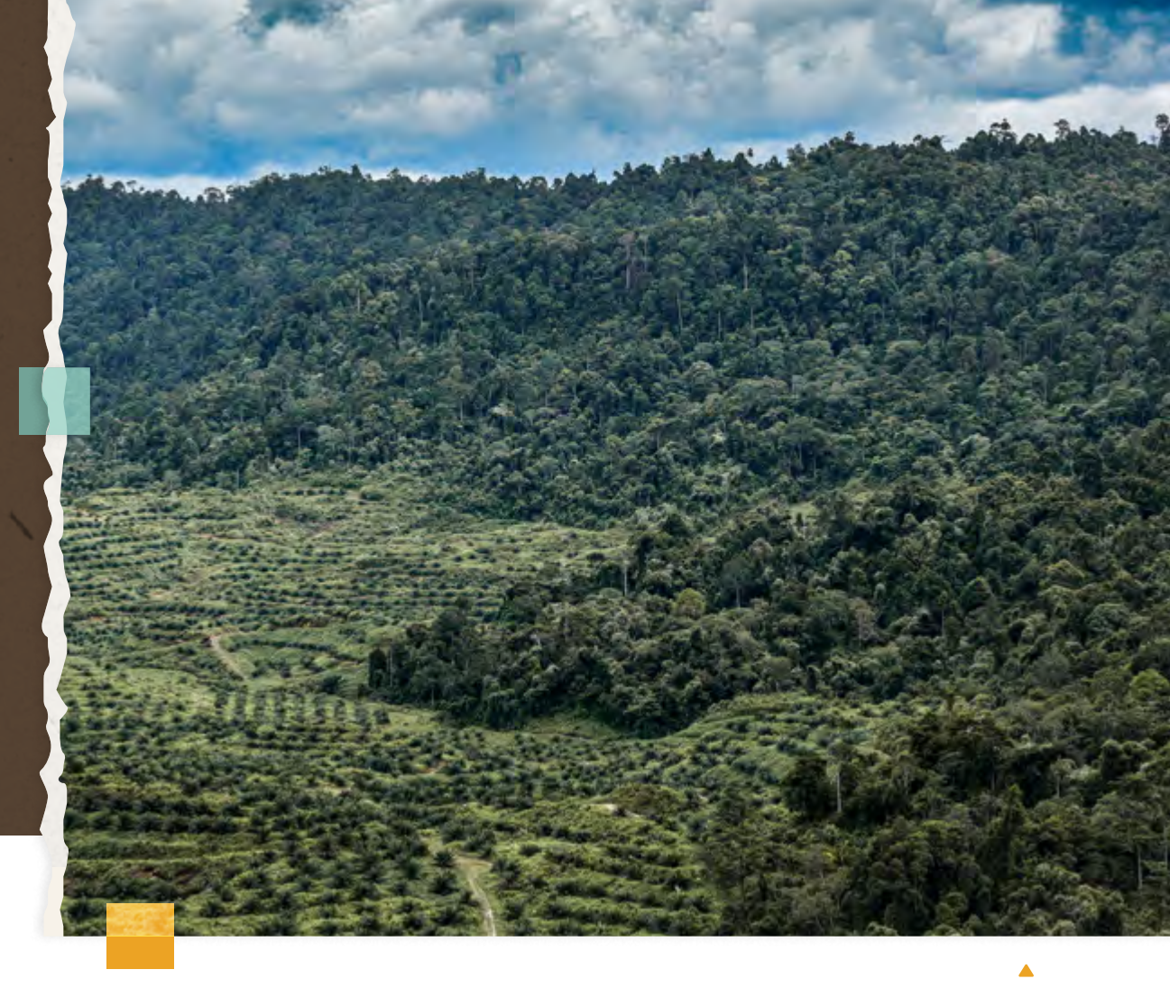
Bukit Durang provides important ecosystem function in an oil palm dominated landscape.

Many large oil palm estates preserve and protect forest fragments and define them as high conservation