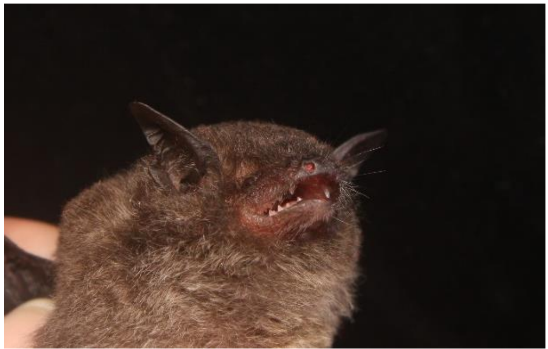
Figure 1. Myotis ridleyi from Bukit Kana National Park

Genetic data provide a better overview of studying the diversity of animals. It is also critical in discovering new mammalian species particularly in diverse groups like the genus Myotis . The species of the genus Myotis are karyotypically conserved and possessed similar morphology among them (Bickham et al. , 2004; Ruedi et al. , 2015). Previous molecular studies have shown that the morphology-based subdivision of the genus Myotis does not match the phylogeny which indicate, the high level of adaptive convergences (Loso et al. , 1998; Stadelmann et al. , 2007). With this strong evidence, it is clear that molecular studies should be the main focus for the analysis of species in genus Myotis .