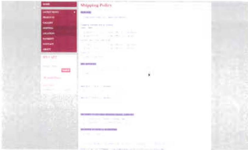
Figure 2.5 Shipping policy

Shipping detail is provided in their website which will clearly describe the shipping policy and cost.