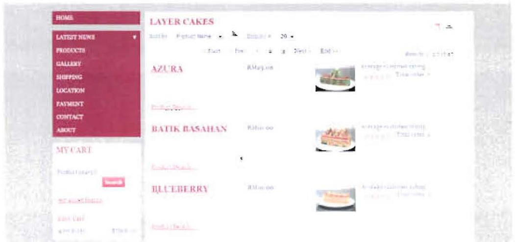
Figure 2.3 Product catalogue and pricelist

Figure 2.3 shows the product catalogue and pricelist. With this feature, customer can know how the cake looks like.