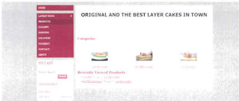
Figure 2.2 Categories of Cake

There are 3 categories of Kek Lapis which is LAYER CAKES, DOUBLE CAKES and SWISS ROLL. Inside each category there are many different and delicious cakes.