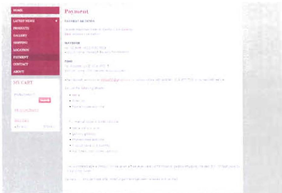
Figure 2.1 Payment methods of Dayang Salhah Kek Lapis

The second method is for express payment (Debit Card/Credit Card/PayPal) which consists of five steps. Firstly, customer has to choose the cakes and add to cart. After that, they have to enter particulars and make payment. Then, the cakes will arrive next day.