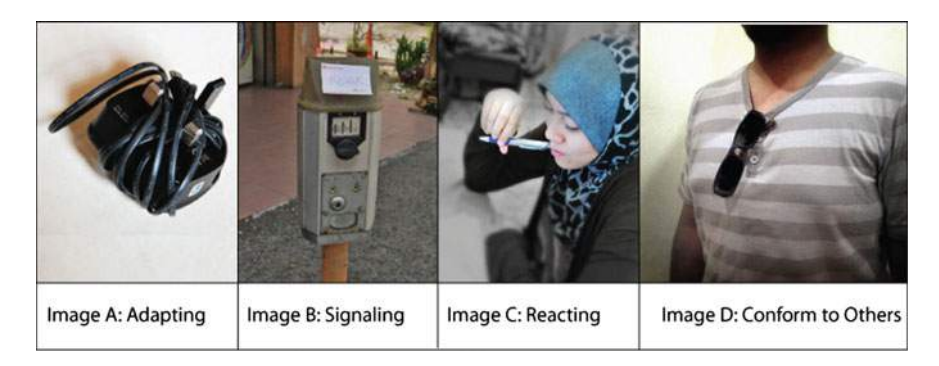
Fig. 5.2 Four polar images