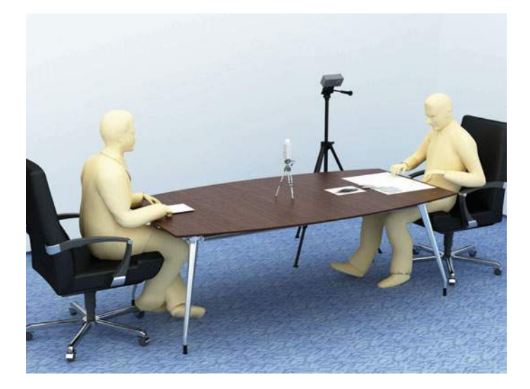
Fig. 5.3 A three-dimensional illustration of designer and the researcher in actual VPA session

(sketching) based on their perceptions, analysis, and reflection on each polar image. In this paper, the designers' response toward the UICHB in everyday product was identified based on three research questions, as follows: (1) an analogy of "how we see things" is claimed as a common way of defining perception [19]. Thus, what are designers' perceptions toward the attributes of unconscious interaction in everyday human behavior as depicted in given polar images? (2) an analysis is a careful study of something to learn about its parts, what they do, and how they are related to each other [20]. Thus, what are designers' analysis on given polar images? and (3) reflection is a conscious and rational action that can lead to making innovation [21]. Thus, what are designers' reflections based on their analysis on given polar images? In order to identify these elements, the researcher needs to derive the explicit explanation and construct the abstract thought, which was grounded in the views of designers. Therefore, coding analysis using grounded theory approach was conducted.