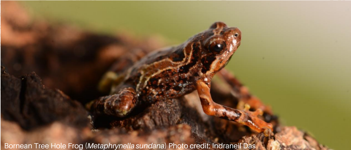
Bornean Tree Hole Frog ( Metaphrynella sundana )

Pang Sing Tyan, Pui Yong Min & Indraneil Das