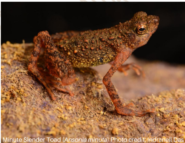
Minute Slender Toad ( Ansonia minuta )

Despite its 9th anniversary celebrating frog diversity, many common folks here imagine a group of frogs put before the line, ready for release and at least one hop to the finish line. No, that does not happen at our Race!