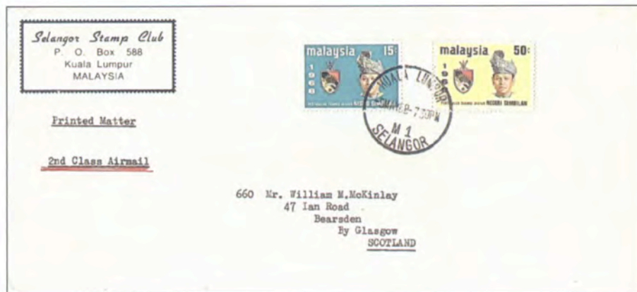
Figure 1: An official Selangor Stamp Club cover franked with a set of the Installation of the Yang di-Pertuan Besar of Negeri Sembilan stamps for second class airmail

The scan below is of an official cover of Selangor Stamp Club (former name for Philatelic Society Malaysia or PSM) in the 1960s, which was used to send a newsletter to a member of the society in Scotland. Franked with a set of stamps of the Installation of the Yang di-Pertuan Besar of Negeri Sembilan, this cover was sent as second class (printed matter) airmail. The stamps were tied with Kuala Lumpur M1 CDS on 5 May 1968.