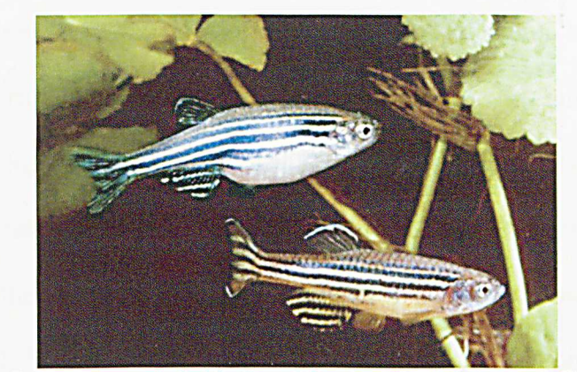
Figure 2. The male zebrafish (lower individual) and female zebrafish (upper individual). Adapted from Braunbeck & Lammer, 2006.

Zebrafish ( Danio rerio ) originates from India, Burma, Malacca and Sumatra (Braunbeck & Lammer, 2006). It is a small fish that can survive in both soft and hard water at 26 °C (Braunbeck & Lammer, 2006). Male zebrafish has a slimmer body shape and reddish tint in its silver bands while the female has a swollen belly, making the sexes can be distinguished easily (Braunbeck & Lammer, 2006). Figure 2 shows two zebrafishes with different sexes. Egg spawning rate is 50 to 200 per days (Braunbeck & Lammer, 2006).