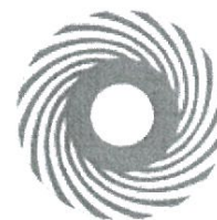
Fig. 2 Initial spiral thrust bearing groove geometry and pressure distribution