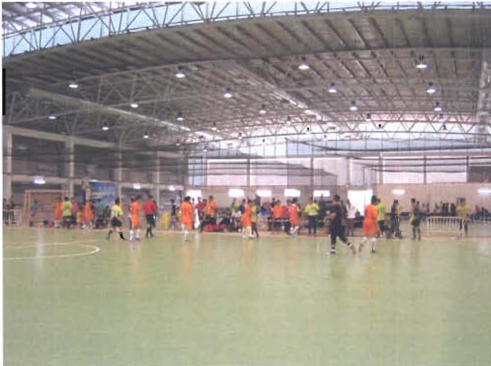
Figure 1.2: Indoor Sport Complex