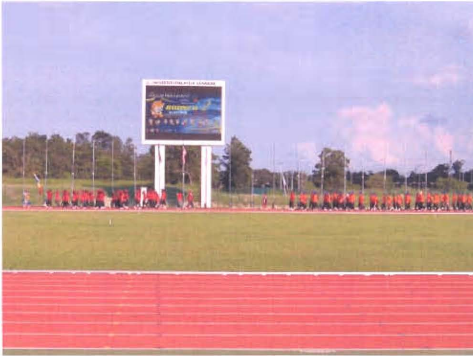
Figure 1.3: Outdoor Sport Complex

The indoor stadium is built for futsal, badminton, squash and Olympic-class swimming pool, while the outdoor stadium, 55-arcs sports complex comprise Olympic-class athlete facilities with 5,000 seating capacity (Borneo Post Online, 2012). UNIMAS Sport Complex provides services for booking sport facilities and equipment, planning and organising events. University's students and staffs can enjoy this benefit to make a booking on the facilities provided, such as, volleyball court, indoor futsal, badminton court, bowling lawn, basketball court, gymnasium swimming pool, and track and field.