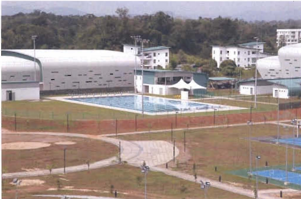
Figure 1.1: UNIMAS Sport Complex