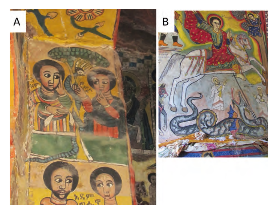
Fig. 18.2 (a) The biblical creation story of Adam, Eve, and the snake in the Garden of Eden is depicted on the wall of Abreha Atsbeha (also known as Abreha we Atsbeha), a rock-hewn church in the Tigray Region of northern Ethiopia. (b) Surprisingly, the story of Saint George slaying the dragon is depicted throughout Ethiopia, in this case at the Betre Maryam Church on Lake Tana in the Rift Valley

At the core of much of the animus toward snakes in the west, however, is the role of the snake in the creation mythology of the Judeo-Christian-Muslim tradition (Fig. 18.2). With minor variations related to language and sectarian tradition is the story of how the snake helped tempt the first woman into the first sin, resulting in the casting of humanity from paradise, the loss of the snake's legs, and an eternal enmity placed between snakes and humans by God himself. Even the Bahá'í religion, a relatively modern derivation which generally preaches kindness to animals, teaches that "harmful animals, such as the bloodthirsty wolf, the poisonous snake and other injurious animals are excepted, because mercy towards these is cruelty to man, and other animals" (Bahá'í Reference Library 1976).