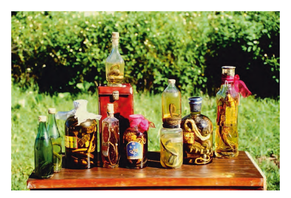
Fig. 18.4 Bottles of "snake wine" confiscated by customs agents on the island of Guam in the Pacific. The contents included a variety of venomous and nonvenomous snakes, as well as lizard, plants, and other organisms