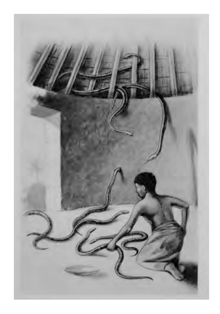
Fig. 18.3 Image from Hambley (1931. Field Mus. Nat. Hist. Anthropol. Ser. 21), showing temple for python worship in the Kingdom of Dahomey (corresponding to modern-day state of Benin, West Africa)

Overall, although snakes are often feared for their lethal potential in the East, and in many places in the developing world are killed on a regular basis, there is nonetheless a more nuanced view of serpents outside the West.