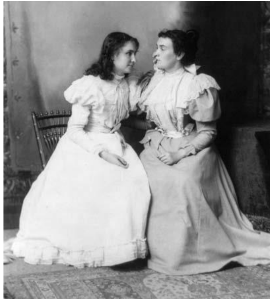
Figure 3: Helen Keller (left) with her teacher, Anne Sullivan.

was sent to teach a 6 years old Helen and took care of her till her death. One famous word was taught to Keller by Sullivan is water. When she fingerspell it to Keller, Sullivan pump water at the same time, to let her feel the water running to her other hand.