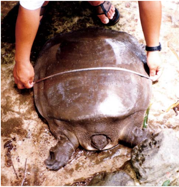
Figure 1. Adult P. cantorii from Kampung Marak Parak, Kinabalu National Park, Sabah, East Malaysia (Borneo).