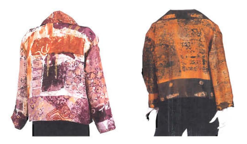
Figure 4: Apparels made from fabric printed using DSP technique

Printed textiles are most often seen in apparels as well as home furnishing fabrics such as table cloths, cushion covers, lamp diffusers and bedding. Textile designers who have previously experimented on deconstructive screen printing made apparels using the printed fabrics. Adoption of fashion innovators is key to uniting sustainable apparel with the fashion community. The fabrics printed using the unconventional techniques will gain more market value when they are turned into fashion apparels. Some of the examples are depicted below: