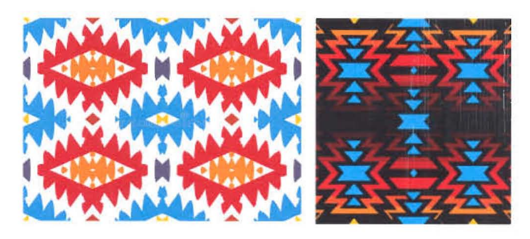
Figure 3: Native American Geometric Motifs

The motifs are often geometrical in pattern and consistent with the color scheme: