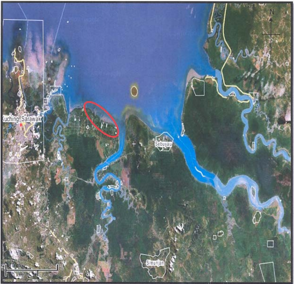
Figure 1: Location of Kampung Jemukan Laut, Sadong Jaya, Sarawak (circle).