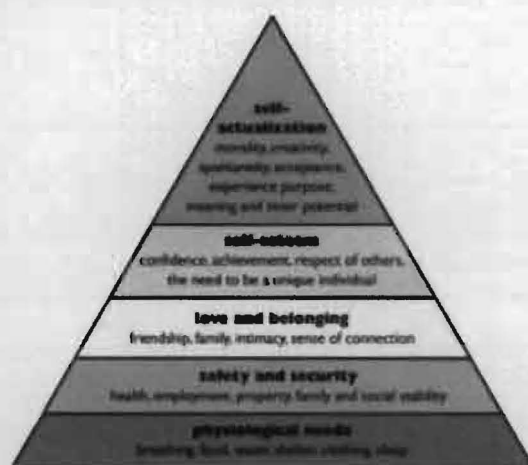
Figure 2.2.1 Maslow's Hierarchy of Needs

In Maslow's hierarchy of needs, there is need for safety and security for each individual. The need for safety and security includes health, occupation, assets, family and social strength. When one person have achieved their physiological needs, like food and water, then their safety needs becomes more significant. Meanwhile when their physiological needs are met, they would try to get a job to create financial safety. That's how physically challenged people trying to get job as to fulfil their needs. If physically challenged people is not given an opportunity to work, how else they would be able to achieve their needs for safety and security. Physically challenged people are also humans with all these needs stated in Maslow's theory, if they are not given a chance to prove that they are capable of getting employed and they can survive without depending on others, they would not be able to feel safe and secured in their life. They would definitely feel insecure in their life and unsatisfied with their life.