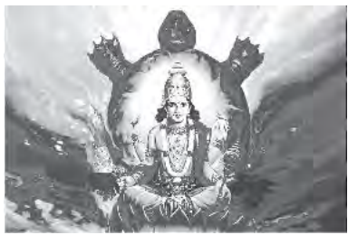
Lord Vishnu in Kurma (Turtle) Avatar

In mythology turtles feature as objects of creation. The turtles feature in many cultures to be a symbol of longevity, patience and wisdom. In Hindu Mythology “ Kurma ” (meaning turtle), one of the Avatar of Lord Vishnu, helped to churn the milky ocean creating the ambrosia of immortality and in the victory of good (Devas) over the evil (Asuras). The Kurma also carries four