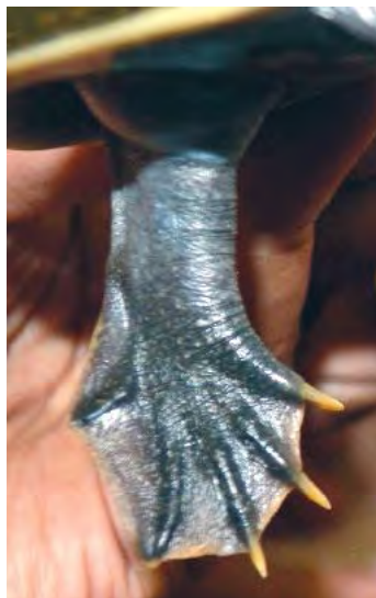
Three clawed limb of N. hurum

The limbs are pentadactyl, and in most, all the digits of forelimb are clawed while the hind limbs have four clawed digits and a reduced clawless digit. However, in all softshell turtles (family Trionychidae ), both the limbs have three