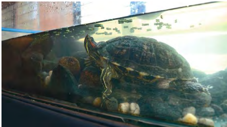
A Pet Trachemys scripta

of reduced space for nesting, depletion of food stock due to overexploitation by humans, pollution, river traffic and sand mining. Damming of rivers, conversion of water bodies into