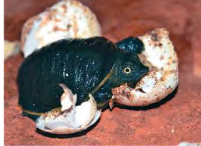
Hatchling of T. punctata

Most of the turtles of the world are highly threatened. Hunting for human consumption is the greatest threat to survival. Pet trade also has adverse affect. Most aquatic and semi-aquatic turtles are facing the problems