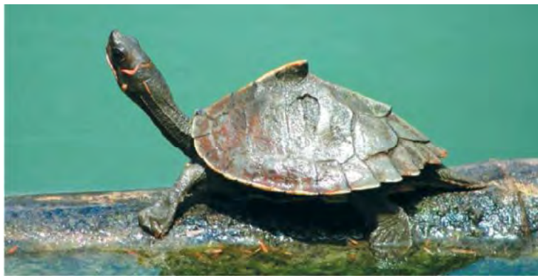
Bony shell of Pangshura sylhetensis

Turtles have characteristic bony shell that completely encases the limb girdles. The shell is unique to the group, but the function and morphology of the shell are variable between the species. The