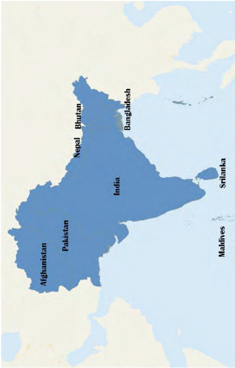
Map of South Asia