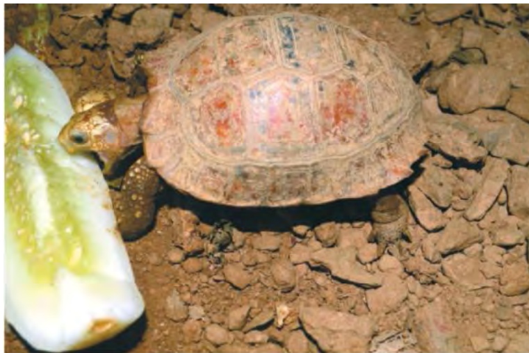
Indotestudo elongata eating cucumber

The Order Testudines ('Chelonia') includes turtles, tortoises and terrapins. They comprise of animals with bony or cartilaginous elements that developed from ribs. The name Chelonia is true to its meaning, and is derived from the Greek word "Kelone", which denotes interlocking armour or shield. These three words, turtles, tortoises and terrapins are quite often interchangeably used and are related to their habitat, although the usage of the terms may vary from country to country. Typically, turtles include all aquatic and semi-aquatic species that tend to be carnivorous but also feed on some vegetation. Tortoises are land-