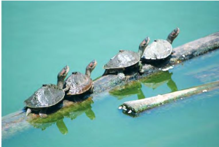
A group of turtles basking, Ugratara Temple, Guwahati, Assam

Turtles are ectotherms, i.e., their body temperature depends on external sources, such as sunlight or a heated rock surface. Thus, there is a constant need on the part of the turtles to bask for maintaining optimal metabolic activities, to deny parasitic