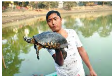
A turtle being released in a temple pond

In many religious shrines of Buddhists, Muslims and Hindus, pilgrims release turtles in the name of God for long healthy life and good fortune. Many tribal and non-tribal communities hang turtle