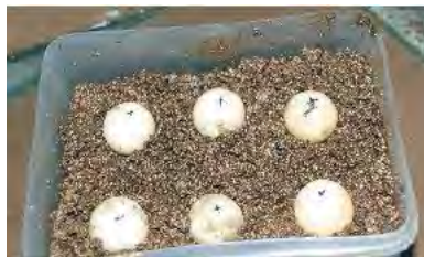
A clutch of eggs of L. punctata incubated artificially

be of various shapes; it is bowl shaped in Spotted Pond Turtle and cone shaped in Cantor's Giant Softshell turtle. Most terrestrial species construct nests on forest floor. The Cochin Forest Cane Turtle lays eggs in small depression and cover the eggs with leaf litter. The female of Asian Brown Tortoise engages both the fore limbs and hind limbs to gather the leaf litters to form a mound. The female deposits eggs inside the mound and sit on top of the mound for days. During the period the female even exhibits aggressive postures to the intruders. It has been discovered that the sex of most species of turtles is determined by environmental factors, most important of which is the temperature of incubation.