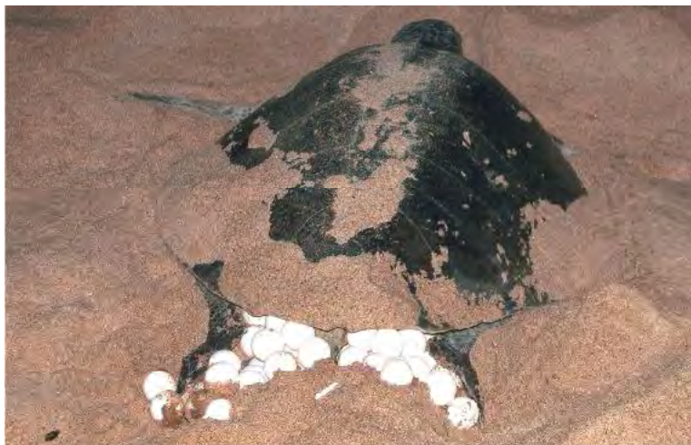
Olive Ridley ( Lepidochelys olivacea ) laying egg

be of various shapes; it is bowl shaped in Spotted Pond Turtle and cone shaped in Cantor's Giant Softshell turtle. Most terrestrial species construct nests on forest floor. The Cochin Forest Cane Turtle lays eggs in small depression and cover the eggs with leaf litter. The female of Asian Brown Tortoise engages both the fore limbs and hind limbs to gather the leaf litters to form a mound. The female deposits eggs inside the mound and sit on top of the mound for days. During the period the female even exhibits aggressive postures to the intruders. It has been discovered that the sex of most species of turtles is determined by environmental factors, most important of which is the temperature of incubation.