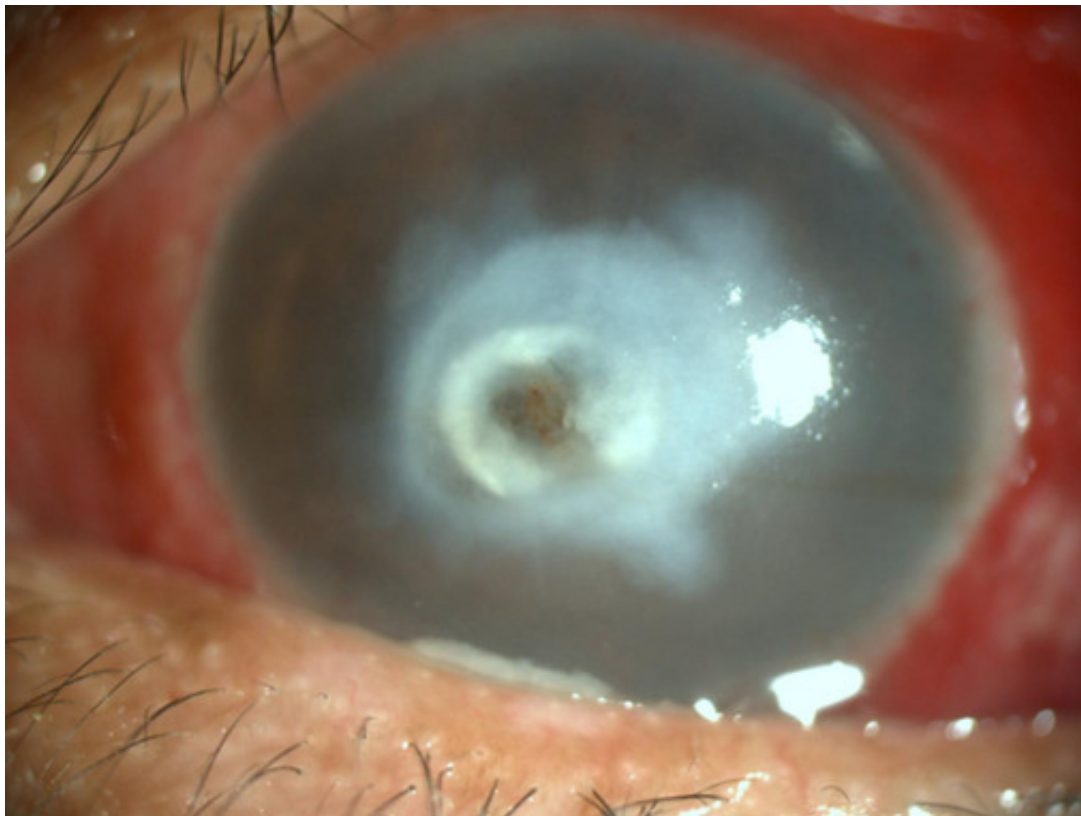
Figure 1: The patient's left eye at presentation.

normal with visual acuity (VA) of 20/20 and near vision of N6.