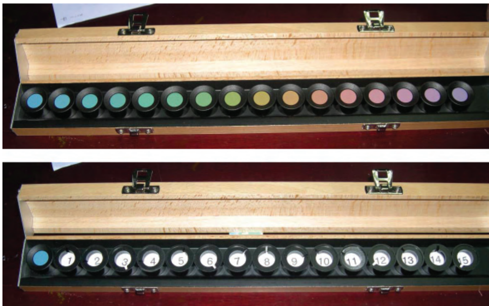
Figure 1. Farnsworth Panel D-15 hue test equipment. Different colour caps put in the black square socket; reverse side of the socket with the discs showing the serial number from 1-15.

repeat Farnsworth Panel D-15 hue test showed that her colour vision returned to normal (Figure 3).