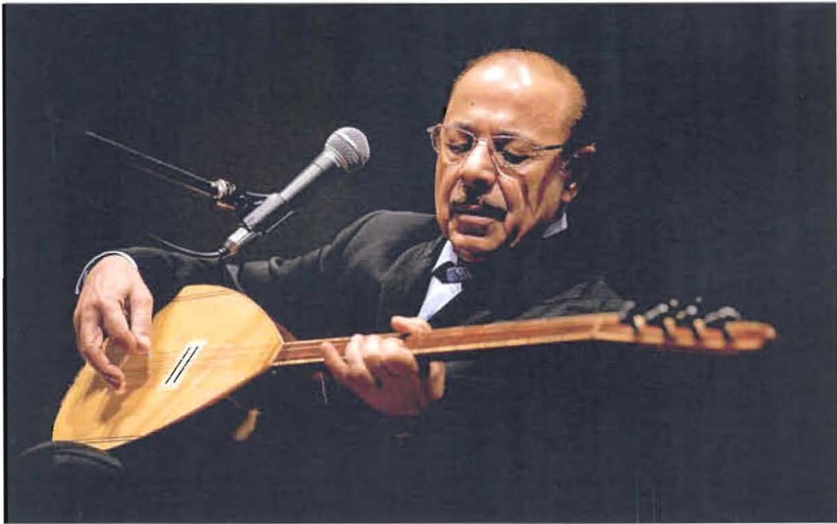
Figure 1: Bağlama, photo from online magazine - The Bağlama: More Than Just An Instrument by Güneş (2016)