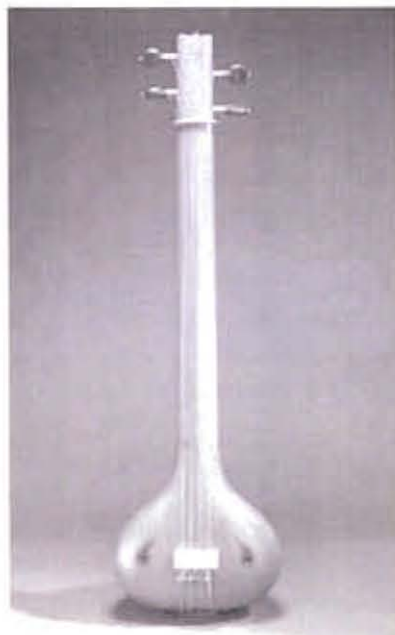
Figure 2: Tamera, photo adapted from eBook – Teaching Music to Children: A Curriculum Guide for Teachers Without Music Training by Bielawski (2010)