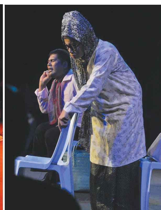
THEATRE performance 'Selipar Jepun Kasut Tumit Tinggi 2' where the creative Walid did lighting designs for the show.