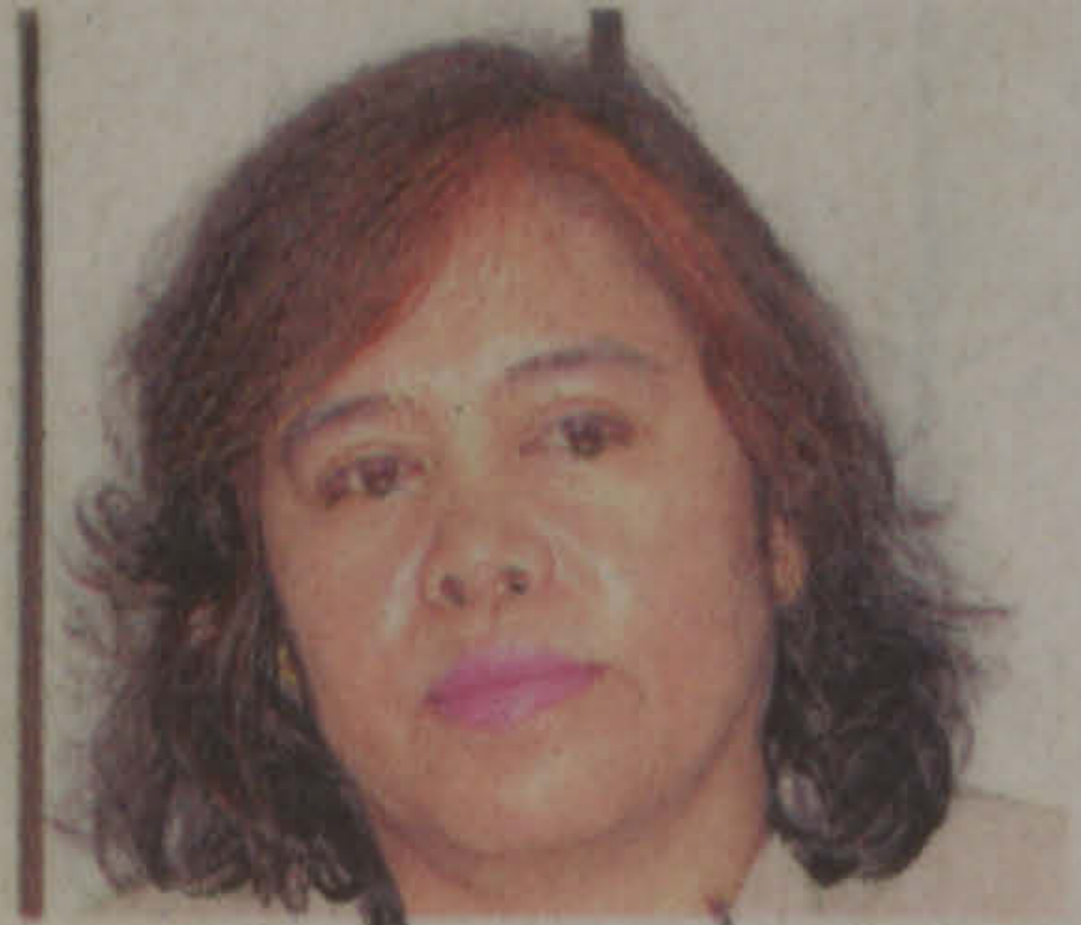
DR ZAHARA: We had our lab check out the samples from the students.

In-campus medical officer says lab check confirms virus belongs to the common enterovirus type